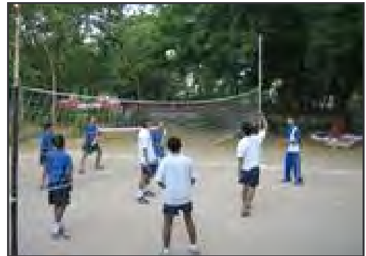
Shivaji House volleyball court