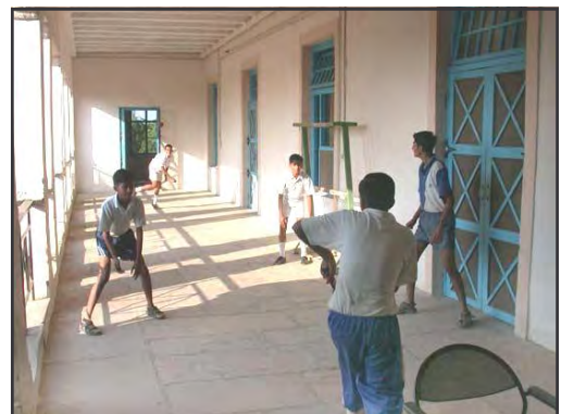
The corridor cricket tournament of the Shivaji House.