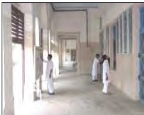
The astachal time