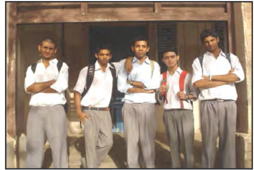
The XII Batch