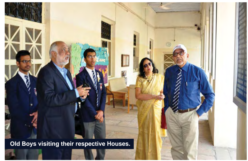
was appreciated by the Old Boys who got an update on what's happening and what is on the anvil in times to come. They all admired the efforts and the imaginative use of space.