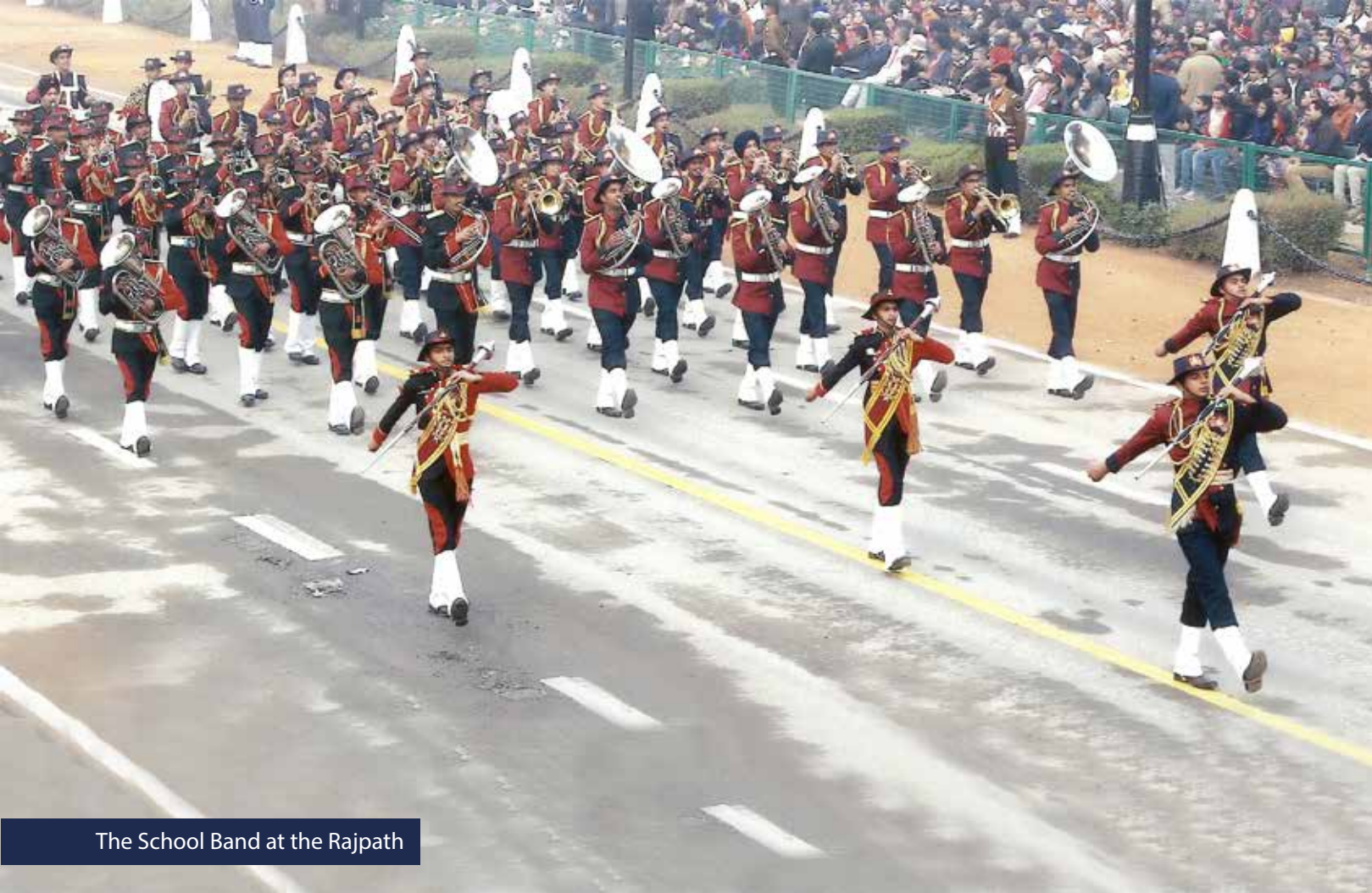
The School Band at the Rajpath