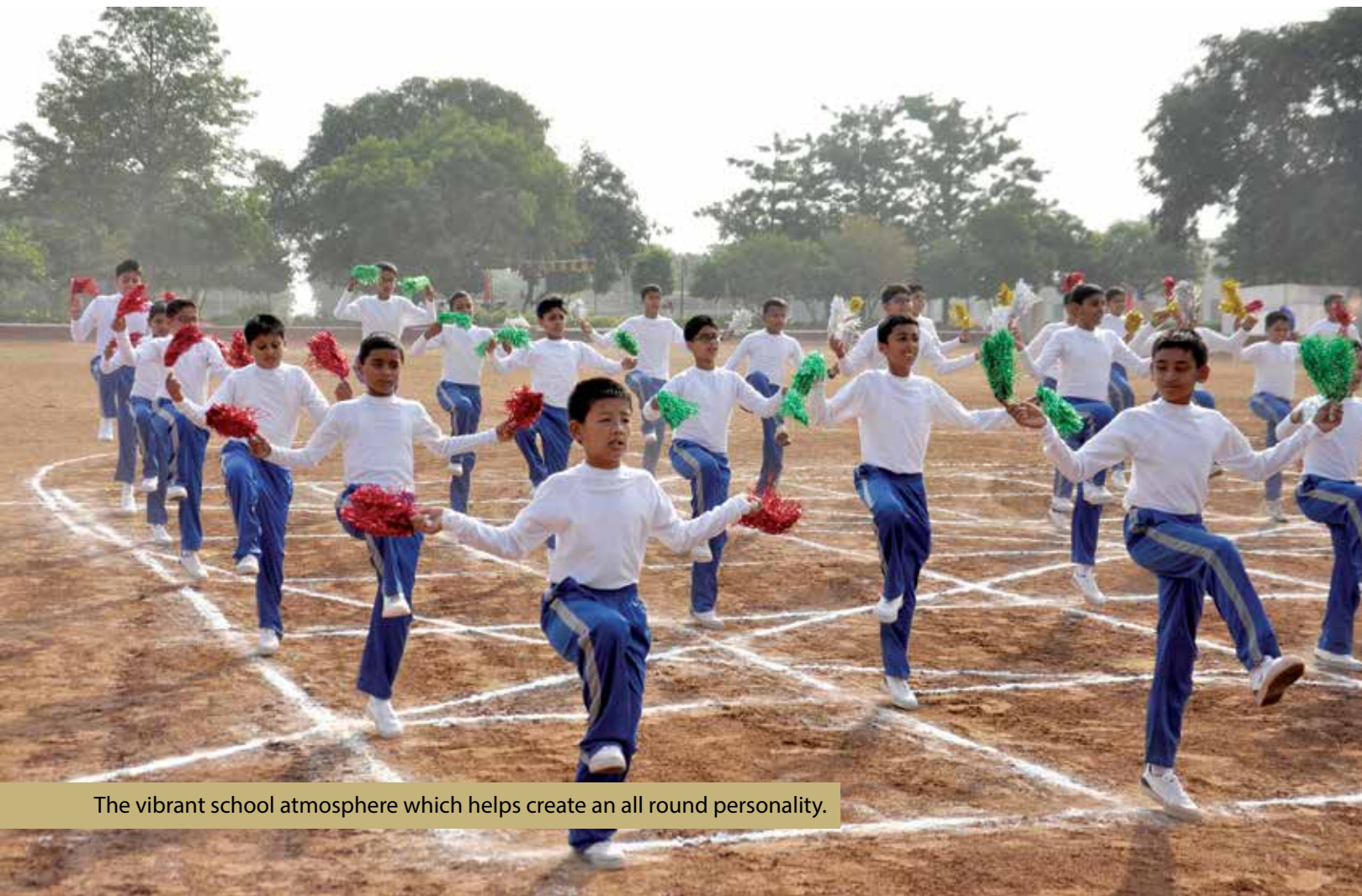
The vibrant school atmosphere which helps create an all round personality.