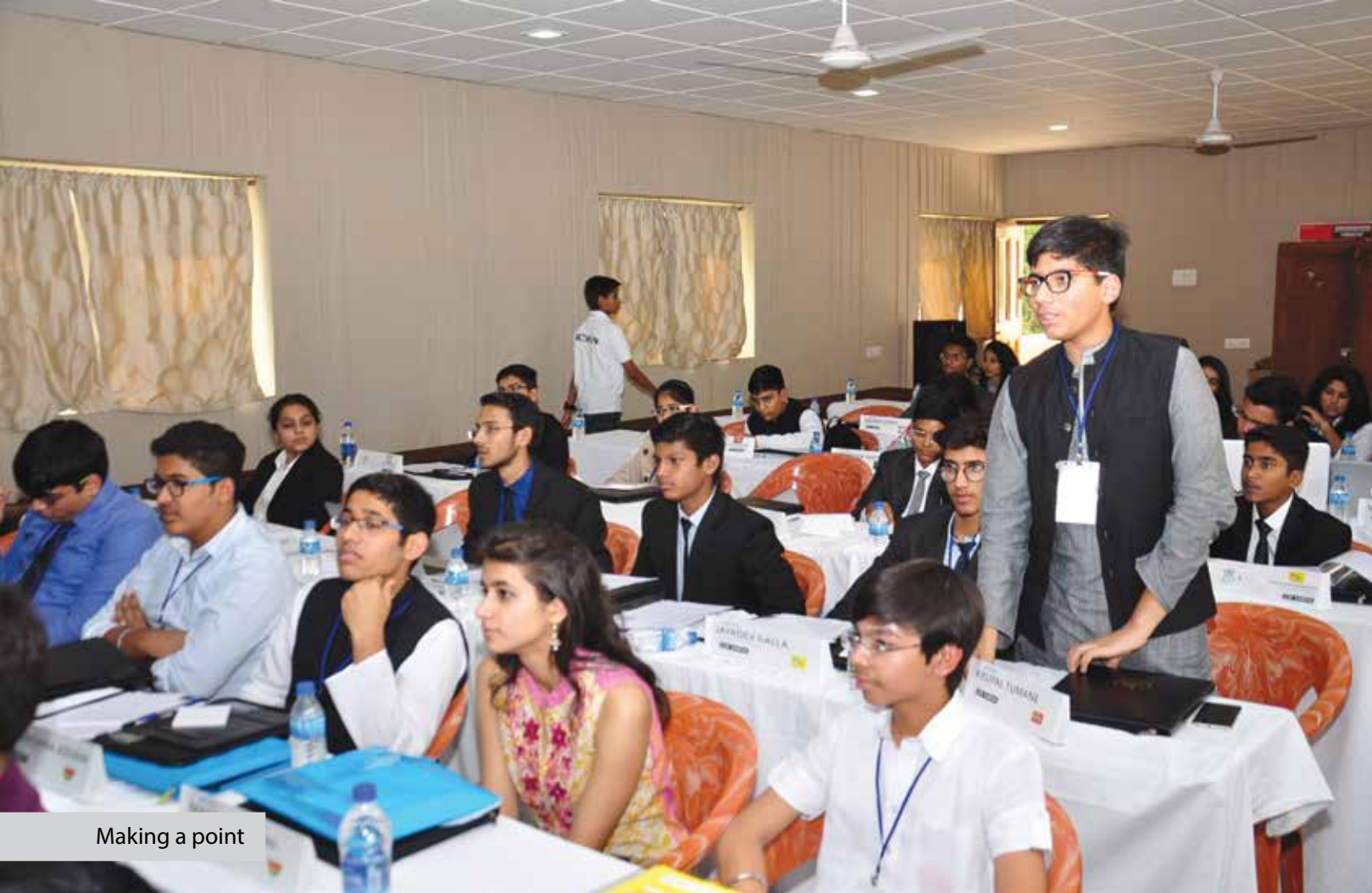
Making a point

schools clash with each other in the true spirit of sportsmanship and fair play. Swashbuckling batsmen, gifted bowlers and outstanding fielders kept the excitement alive till the last match. The Tournament was won by Modern School, New Delhi.