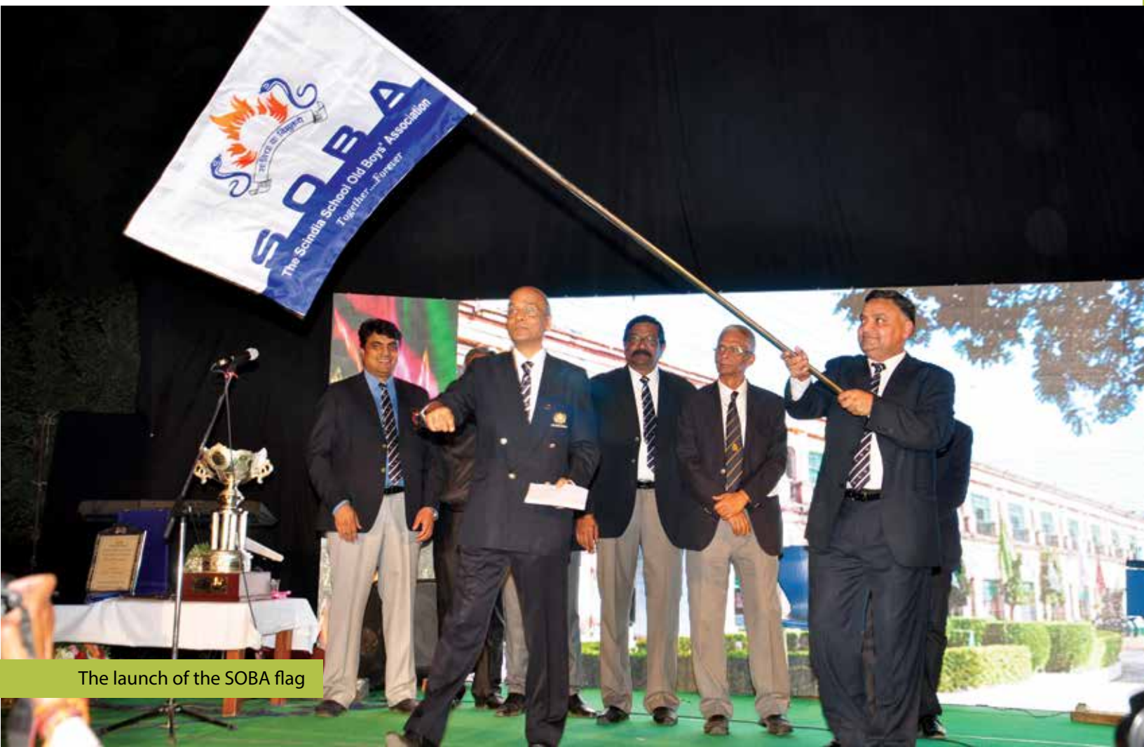
The launch of the SOBA flag