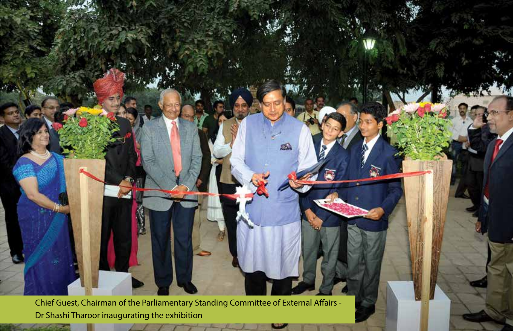
Chief Guest, Chairman of the Parliamentary Standing Committee of External Affairs - Dr Shashi Tharoor inaugurating the exhibition