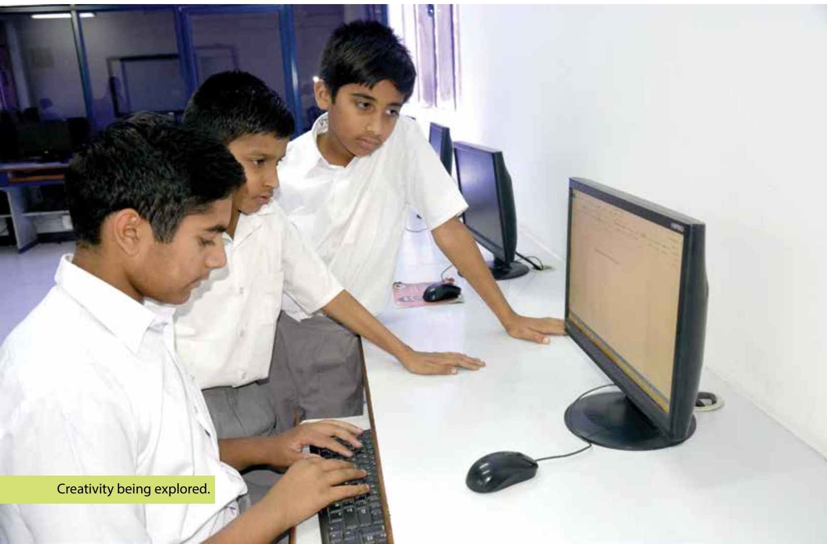
Creativity being explored.