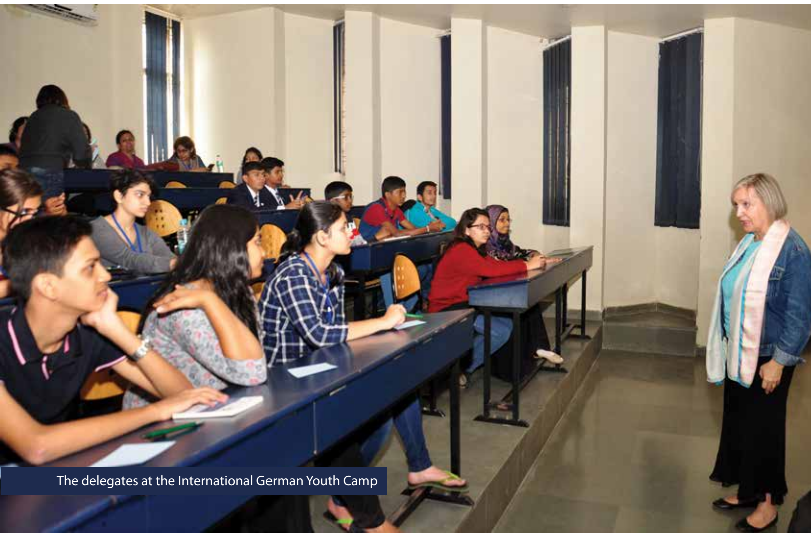
The delegates at the International German Youth Camp