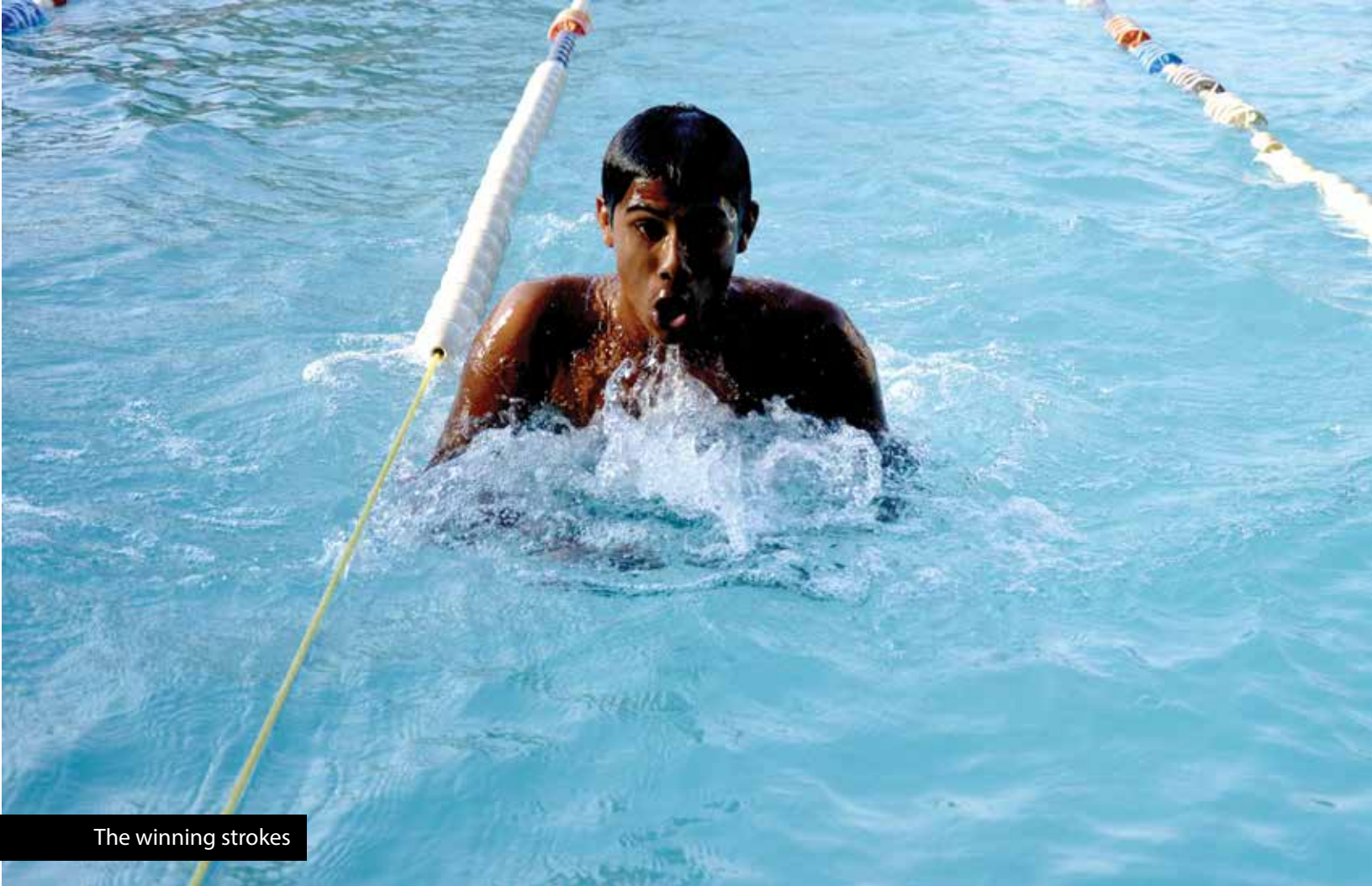
The winning strokes