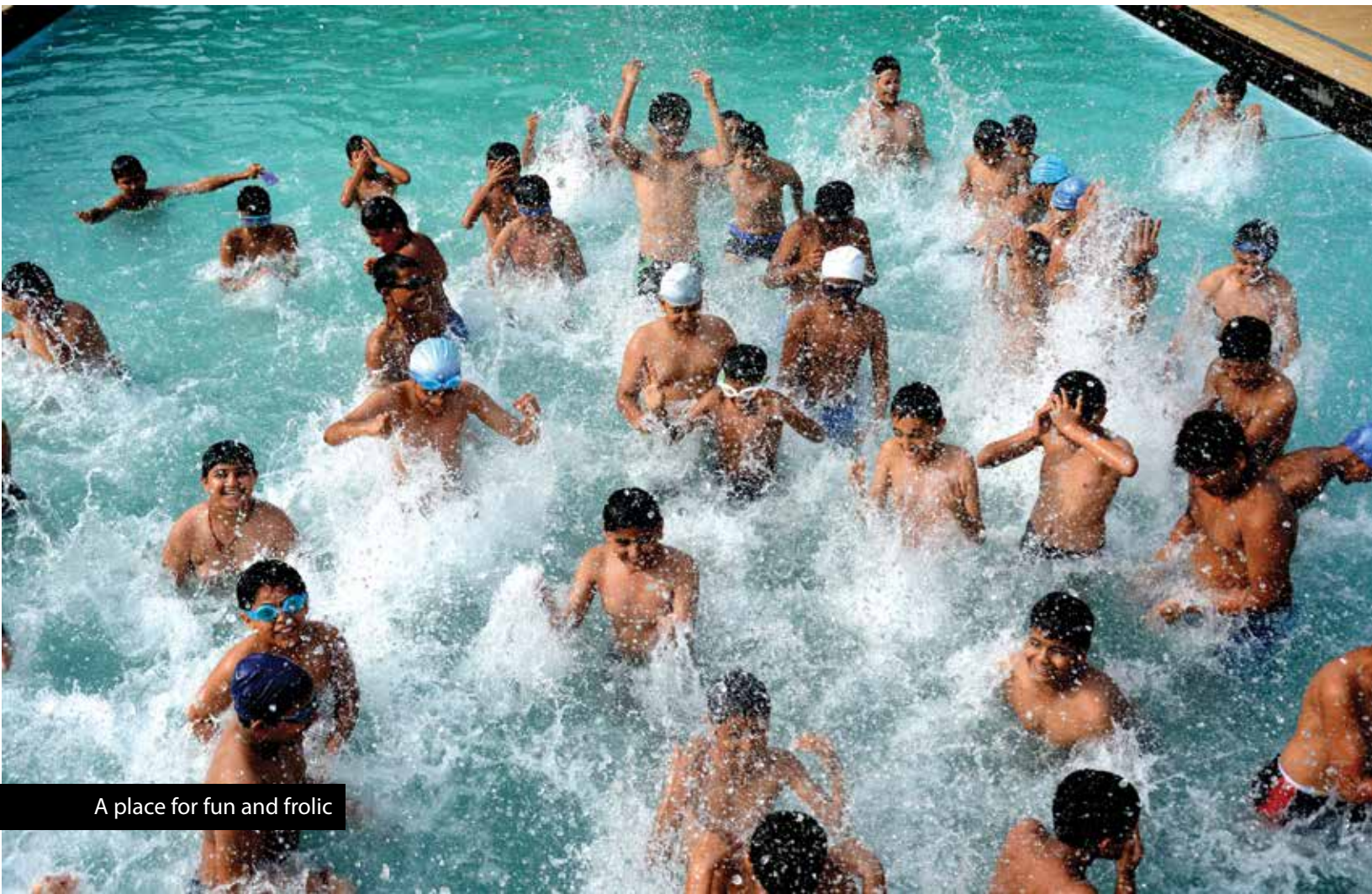
A place for fun and frolic