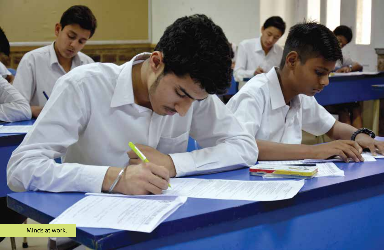
Minds at work.