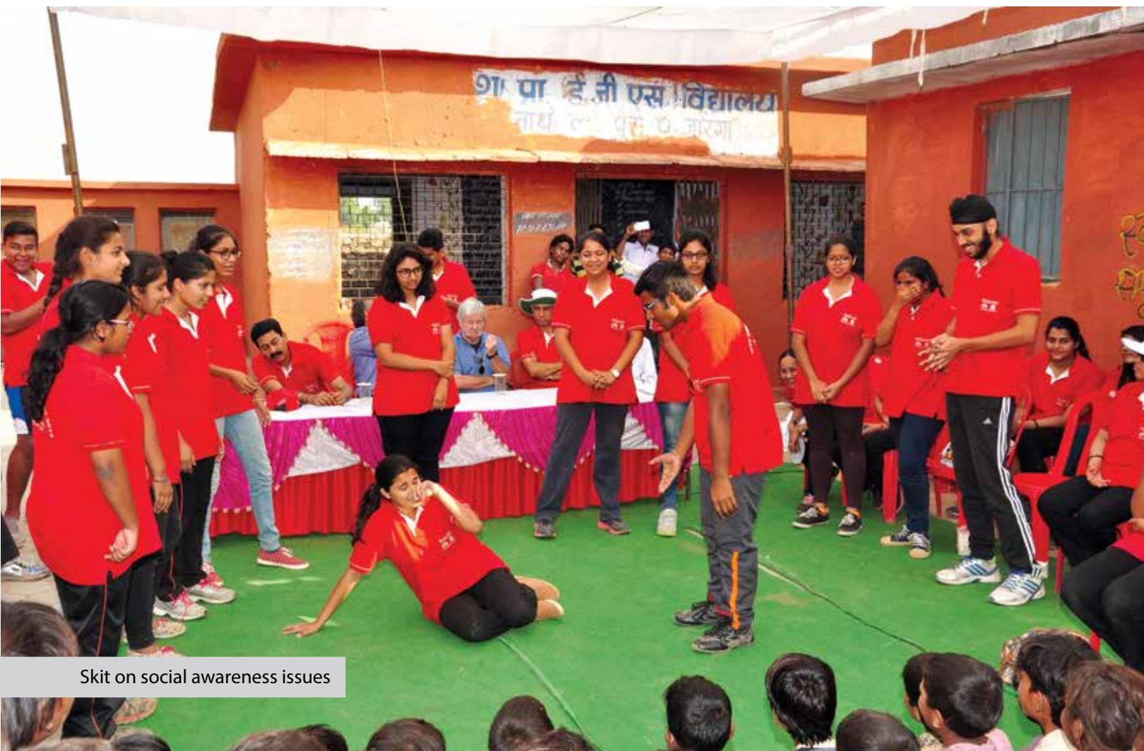
Skit on social awareness issues