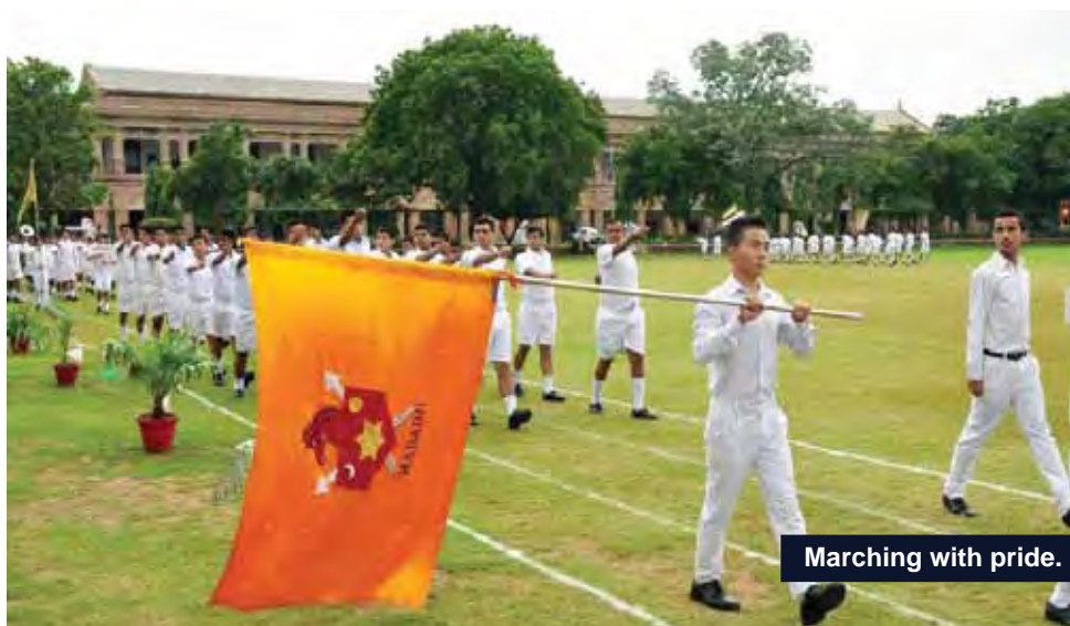
Marching with pride.