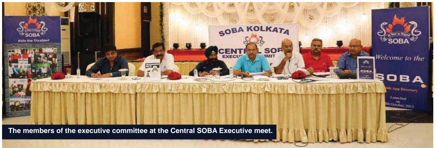
The members of the executive committee at the Central SOBA Executive meet.