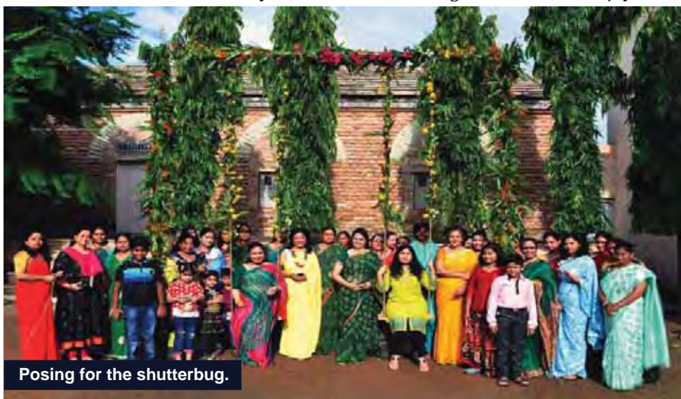
Posing for the shutterbug.

The ladies celebrated the joyousness of saavan by congregating for a ' Jhoola party ' on Wednesday, 24th August, under the auspices of the Ladies' Club . There was palpable excitement as this was the first special event organized after the revival of the Club. Dressed in their finery the ladies came in large numbers and enjoyed the