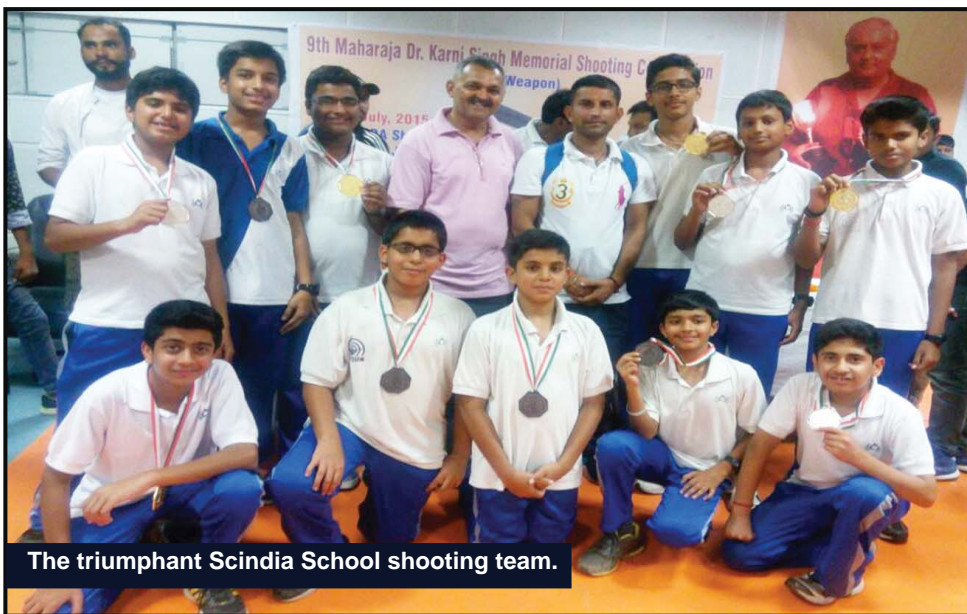
The triumphant Scindia School shooting team.

The school shooting team participated in the 9th Maharaja Dr Karni Singh Memorial Shooting competition held at JDA shooting range in Jaipur from Thursday, 23rd- Sunday, 26th July. The scindian shooters bagged medals in various categories. The results are as under: