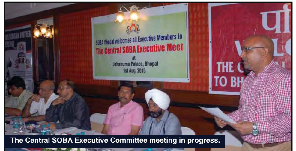
The Central SOBA Executive Committee meeting in progress.