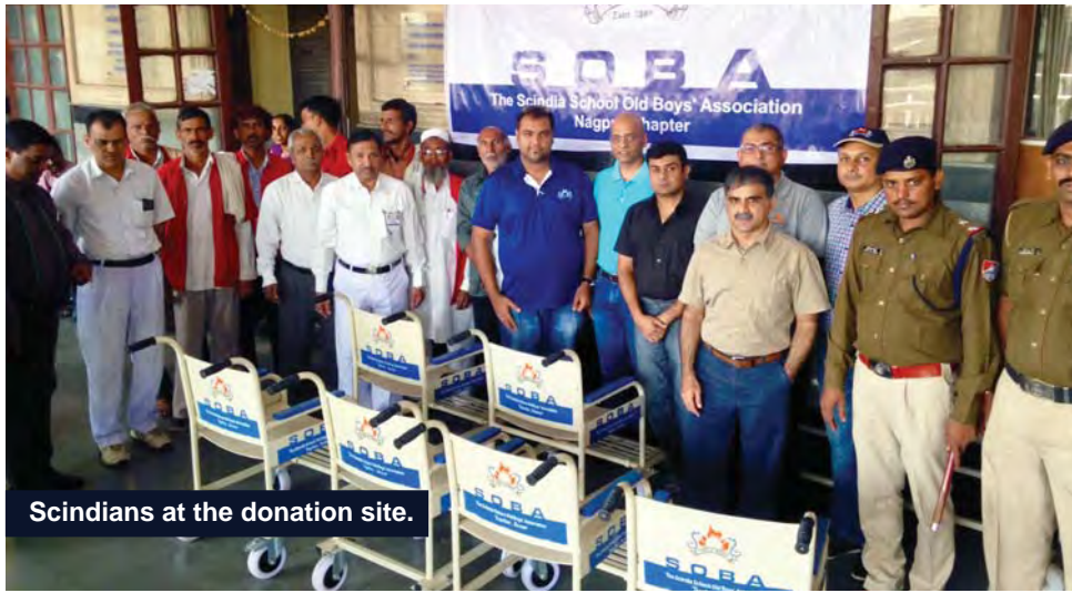
Scindians at the donation site.