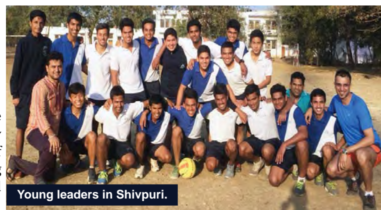
Young leaders in Shivpuri.