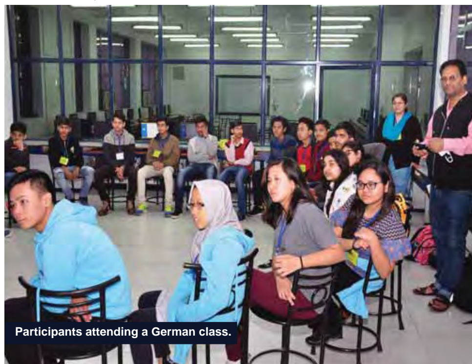
Participants attending a German class.

The Scindia School hosted the International German PASCH Youth Camp from 2nd - 8th Jan 2017, in collaboration with GOETHE INSTITUT - New Delhi. In this event, a total of 104 students and teachers from Bangladesh, Nepal, Sri Lanka, Indonesia and India participated. The Youth Camp primarily focused on providing high quality German Language classes to the participants to improve their proficiency. Parallel to the German classes, three especially designed workshops too were organized. First workshop was on - Innovations in Germany; second was on - Musicians from Germany; and third was on - Art forms of Germany with clay as the medium. All the participants thoroughly enjoyed these workshops. Apart from attending the Youth Camp, participants enjoyed the heritage and the cold weather of the Fort. They also went around the Gwalior city and saw the usual tourist attractions.