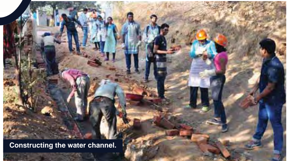
Constructing the water channel.

For the next three days i.e. on the 20th, 21st and the 22nd delegates left the Fort for the work site at 8:45 am and the above mentioned work continued with gusto. Delegates endlessly passed tubs full of cement and bricks and continuously cleared big piles of sand and mud lined up on both sides of the water channel. This work was extremely tiring and time consuming. On the penultimate day after lunch, the delegates left for the Jai Vilas Palace to visit the museum. Delegates were aweestruck by the rich heritage and the sheer regalia of the Scindia dynasty, museum and the Palace. They also saw many old weapons and rare artifacts. After returning to the fort the students changed into smart casuals and assembled at the school's Assembly Hall for an interactive session on 'Prioritizing Round Square IDEALS'. Each student discussed and