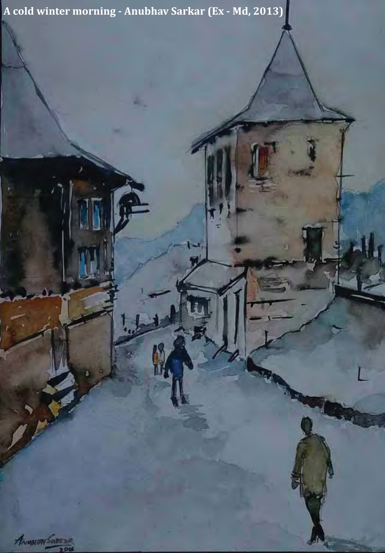
A cold winter morning - Anubhav Sarkar (Ex - Md, 2013)