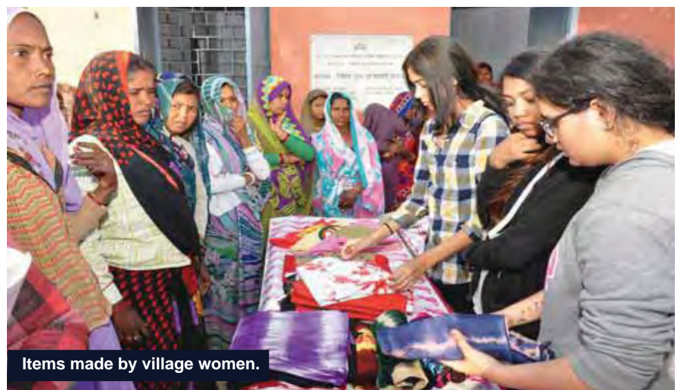
Items made by village women.

Representatives from participating schools shared their experiences of the said project. One thing which was felt across was the immense sense of contribution which the delegates derived from all that was done in the course of the previous four days. All in all it was a successful project which not only accomplished all that was planned but also helped the delegates absorb the Round Square IDEALS in the truest sense.