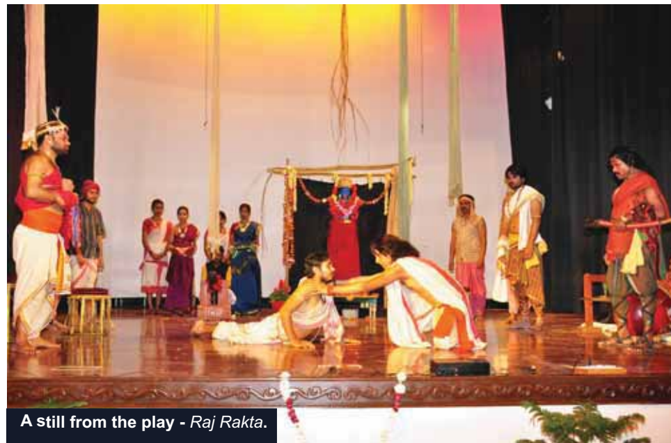
A still from the play - Raj Rakta.

Under the aegis of Society for the Promotion of Indian Classical Music and Culture amongst the Youth (SPIC MACAY), the Naya theatre group enthralled the school community with a spectacular theatrical production entitled Raj Rakta on the 5th of February 2017. The play was based on the legendary Rabindranath Tagore's Visarjan and Rajarishi . The play was set in Tripura. The powerful satirical play struck at the root of superstition and associated socio-