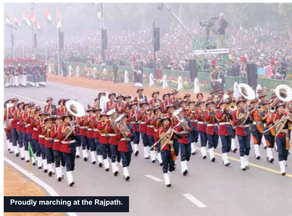
Proudly marching at the Rajpath.

A plethora of activities at the school front continues. It is a matter of great pride that the School Brass Band Contingent has brought laurels to the school. 44 boys of the Scindia School Brass Band represented the school at the 68th Republic Day Parade in Delhi. They participated in the inauguration of the camp on 6th January where they performed in front of the Vice President of India – His Excellency, Mr Hamid Ansari. On the 16th, our boys were a part of