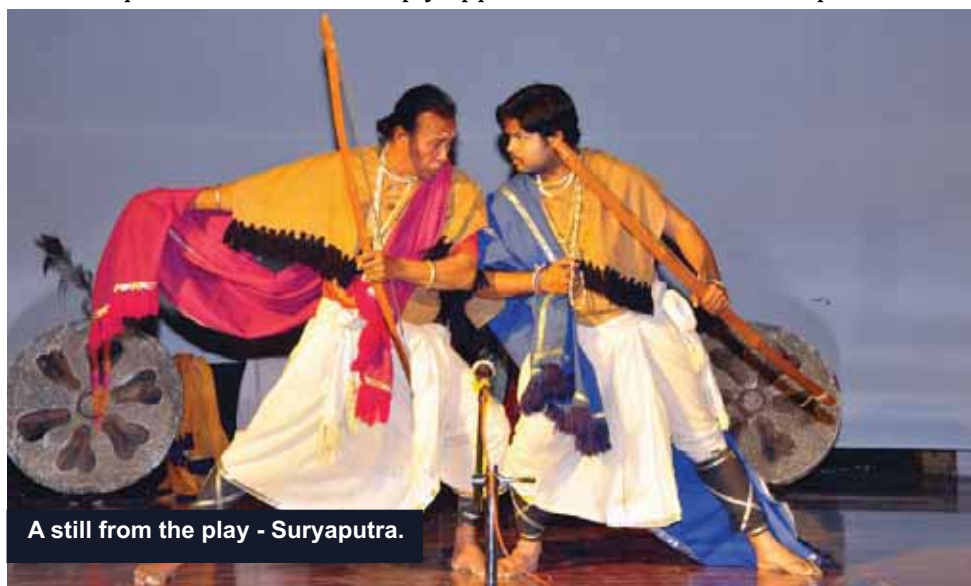
A still from the play - Suryaputra.