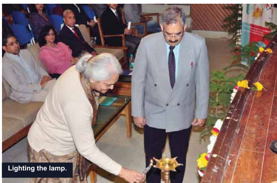
Lighting the lamp.