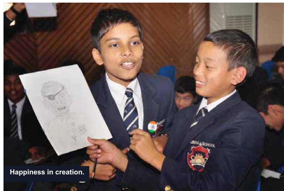
Happiness in creation.

how to frame the outline of the story and thereafter fill in the gaps. She made the students frame the outline of a suspense story. The sessions were filled with techniques and strategies for enhancing writing skills in all genres.