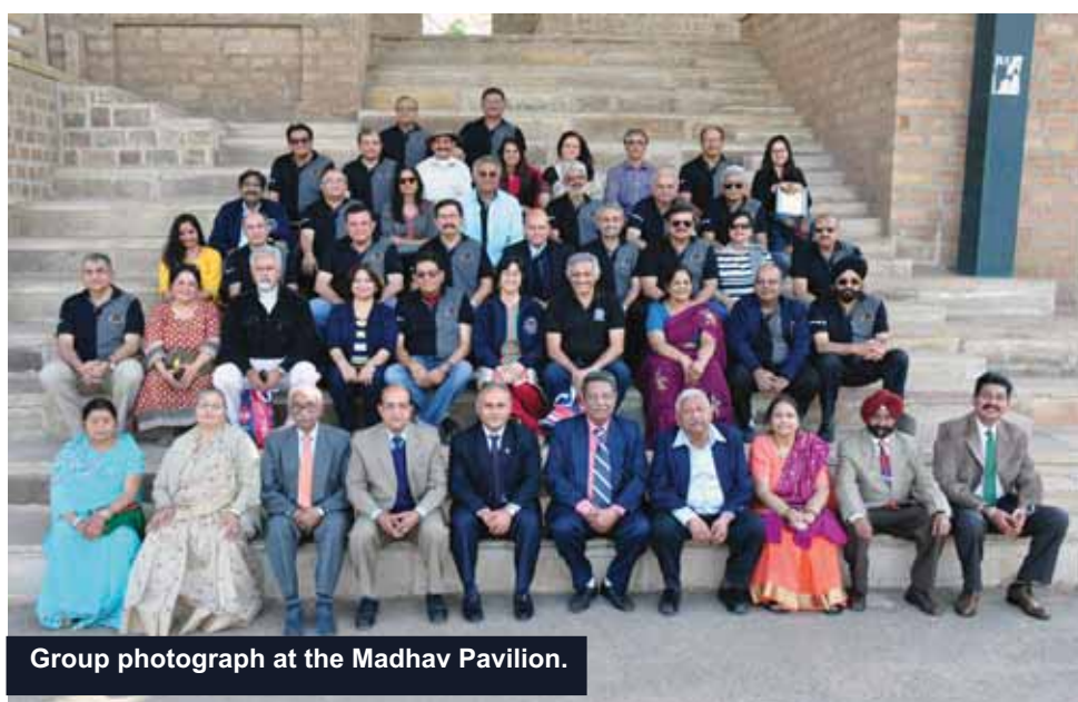
Group photograph at the Madhav Pavilion.