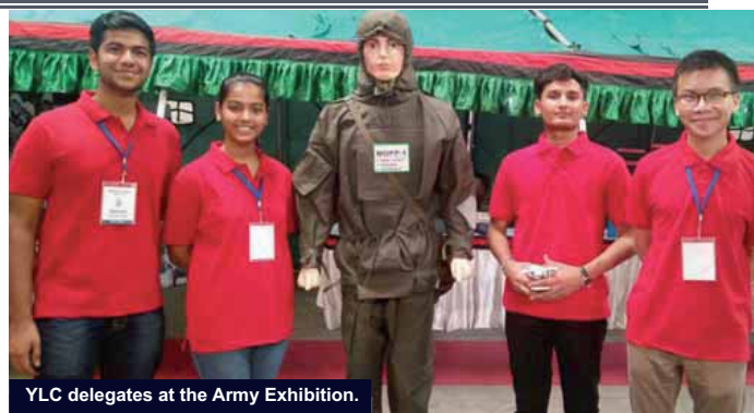
YLC delegates at the Army Exhibition.

All through the five days the students stayed with host families and returned