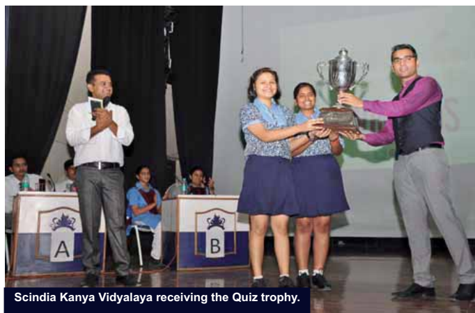
Scindia Kanya Vidyalaya receiving the Quiz trophy.