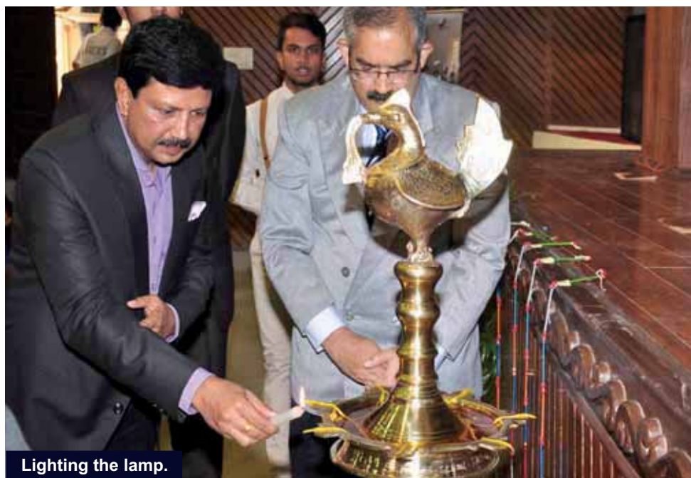
Lighting the lamp.