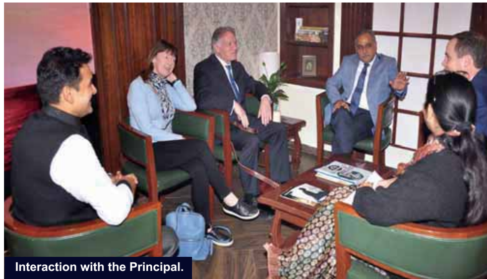
Interaction with the Principal.

The Headmaster of Toowoomba Grammar School, Australia along with the Head of the Curriculum, of the same school visited the School on 7th December 2017.