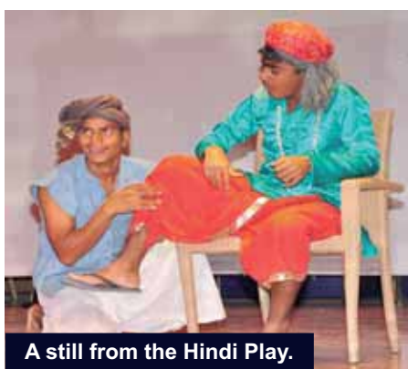
A still from the Hindi Play.

The Jayappa House Evening was held in the Assembly Hall on 13th November 2017. The evening commenced with the choir singing the beautiful fusion of kunfaaya kun and khwaaja mere khwaaja . Next, were the talented instrumentalists who played jai ho . It created a wonderful symphony. The English play gave a wonderful message of humanity and compassion. The Hindi Play touched on a very serious topic.