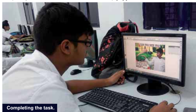
Completing the task.