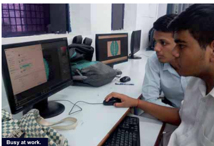
Busy at work.