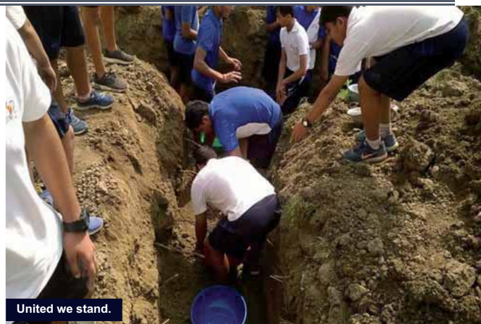
United we stand.

It was an enriching experience to say the least and we owe a special thank you to the people of the village for making us a part of their lives and for the warm welcome we received from each one of them.