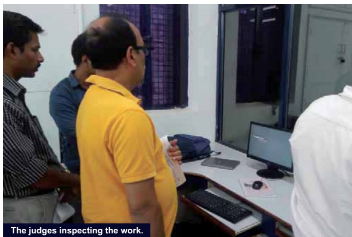
The judges inspecting the work.