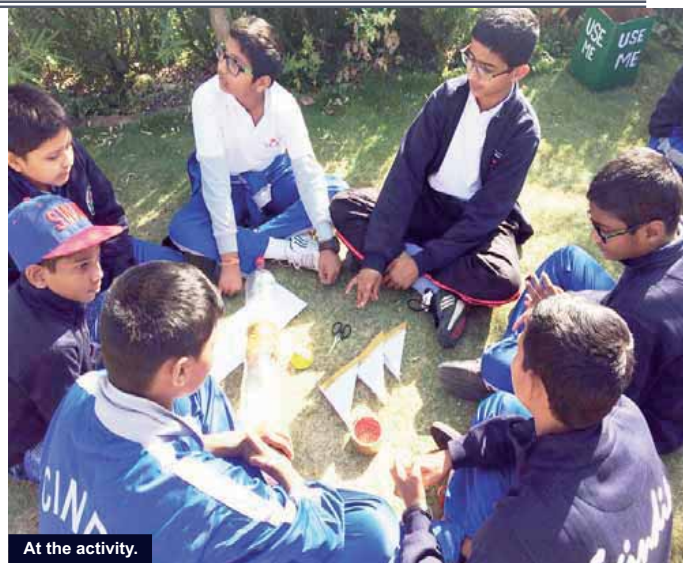
At the activity.

Day 2 began on a good note- post breakfast as we departed for an easy and delightful trek. On October 26th we enjoyed an exciting Rocket Making and launching session. It was followed by Mega Challenge, a high power team based activity that encouraged healthy competition. The winner was not the team that finished a task first, but the team that effectively completed a series of tasks based on the learning from various activities during the camp including following safety protocols, LNT principles, cooperation, team work, effective communication and other group activities. We also visited Tehri dam on the second last day.