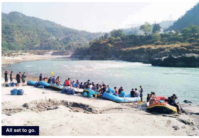
All set to go.

hill, and the Roller coaster. We all finished our rafting at the NIM beach, a few meters before the 'Laxmanjhula'. We said goodbye to our guides and started the journey back to School with unforgettable memories.