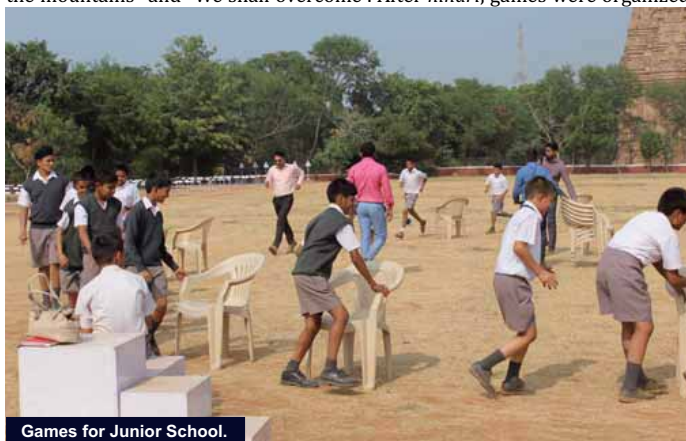
Games for Junior School.