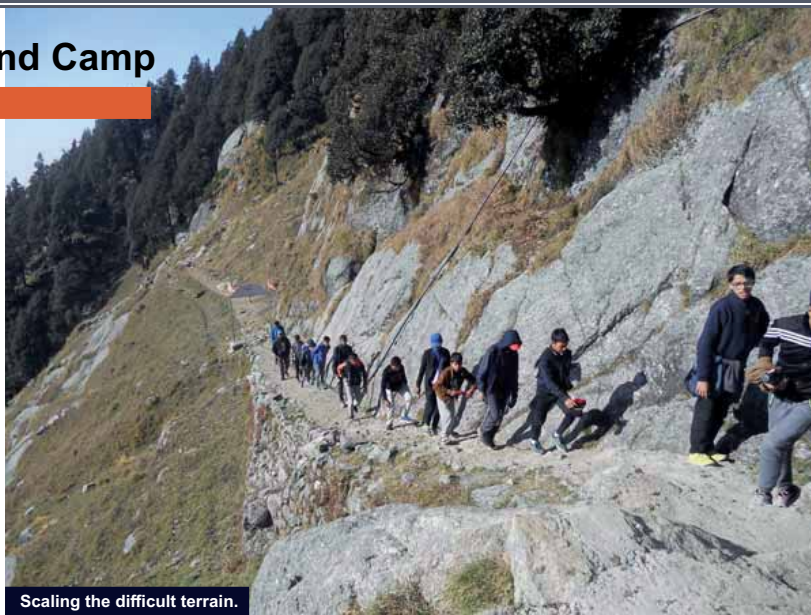
Scaling the difficult terrain.