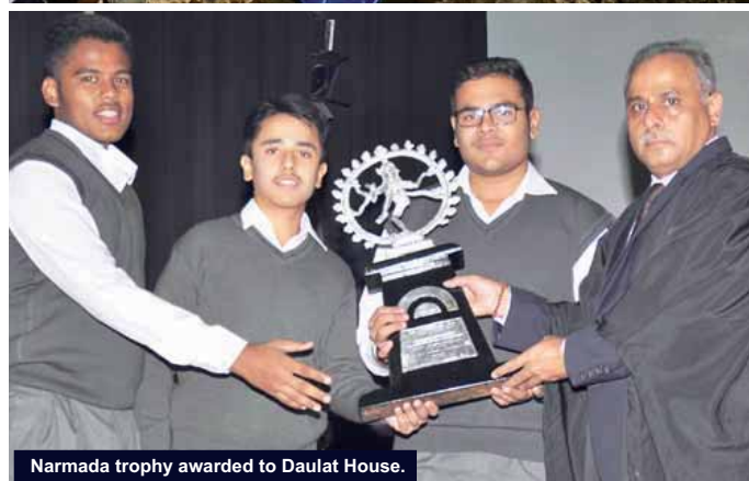
Narmada trophy awarded to Daulat House.