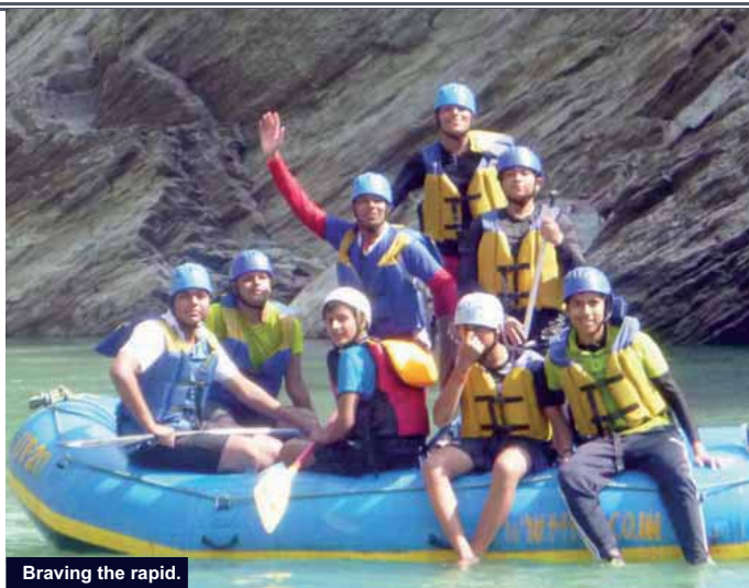
Braving the rapid.

On the next day, we started our rafting from the last stop. From there we went onto experiencing some of the good rapids like the Clubhouse, the Meadow