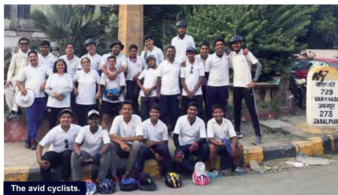
The avid cyclists.