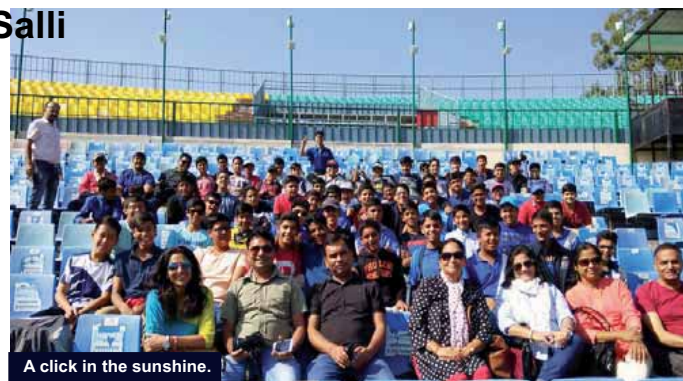
A click in the sunshine.

The next day morning we left for Salli, thoroughly enjoying the landscape and the cold breeze. All the students were thrilled with the thought of staying in the tent which was a novel experience for them. Here after lunch students enjoyed adventure activities i.e Flying Fox, Burma Bridge, Commando Net & Mogli Walk etc. As the sun was setting into the horizon with the last gleam of light losing itself in darkness, the temperature started falling. To relieve us of the chill, we had a bonfire, coupled with the fresh vegetable soup that soothed our souls.