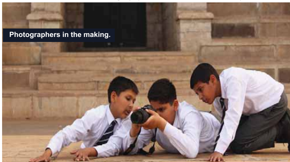
Photographers in the making.

A Photography workshop was conducted in the School on 24th February 2018, for the members of the Photography Club. It was conducted by Mr Saurabh