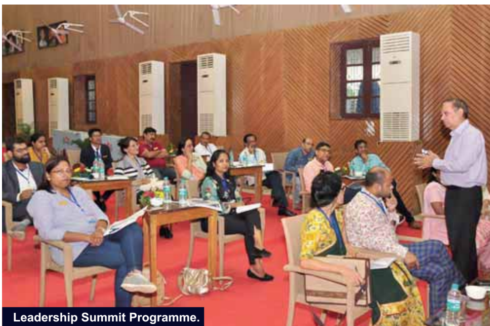
Leadership Summit Programme.