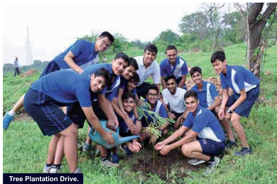
Tree Plantation Drive.