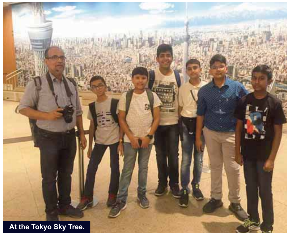
At the Tokyo Sky Tree.

Japanese popular culture not only reflects the attitudes and concerns of the present day, but also provides a link to a glorious past. Popular films, television programs, manga (comics), music, and video games, all have developed from older artistic and literary traditions. Many of their themes and styles of presentation can be traced to traditional art forms. Contemporary forms of popular culture, much like the traditional forms, provide not only entertainment but also an escape for the contemporary Japanese. Six boys of Class VIII,