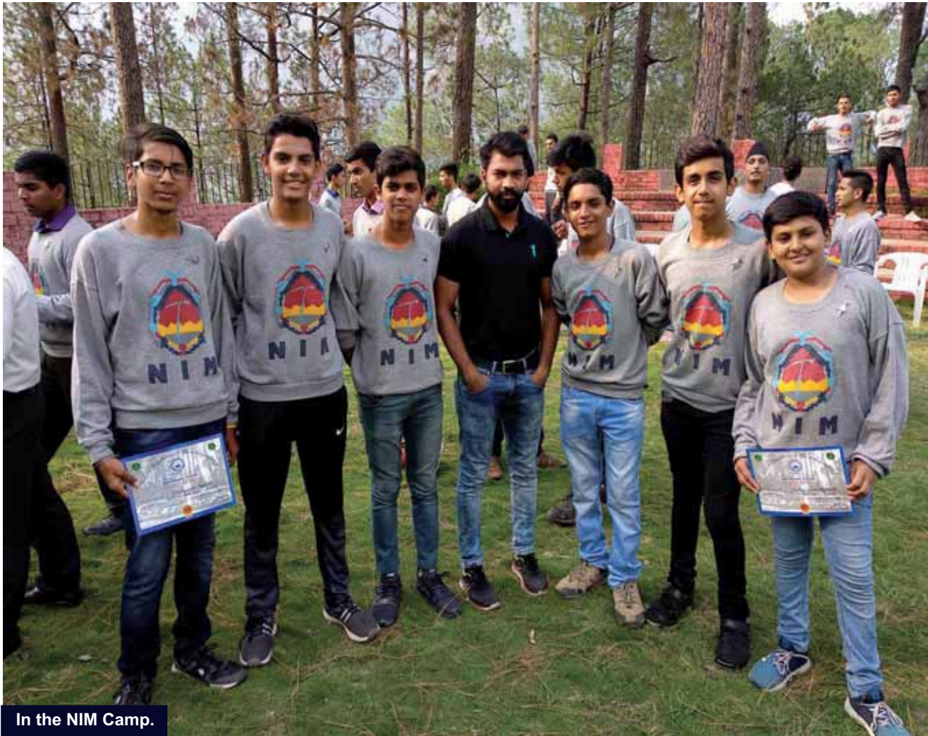
In the NIM Camp.