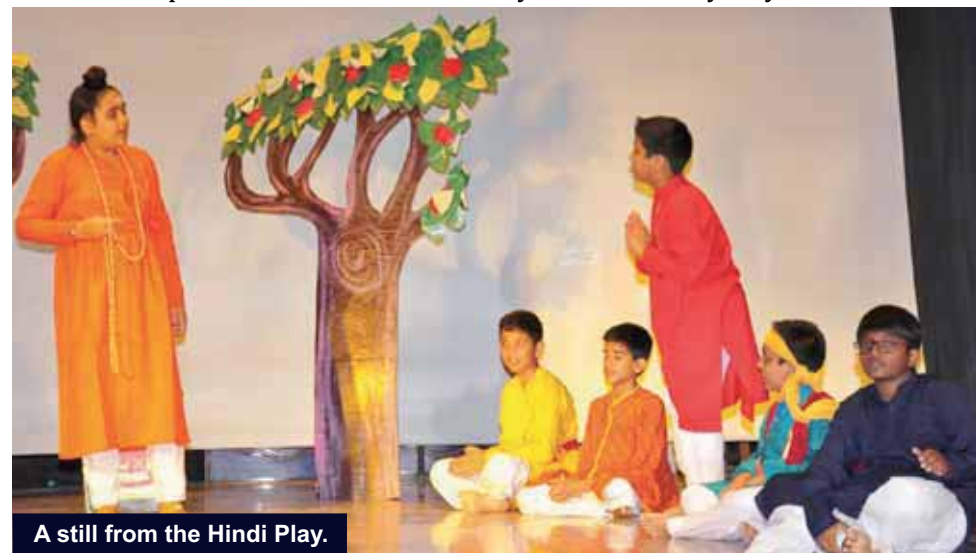
A still from the Hindi Play.