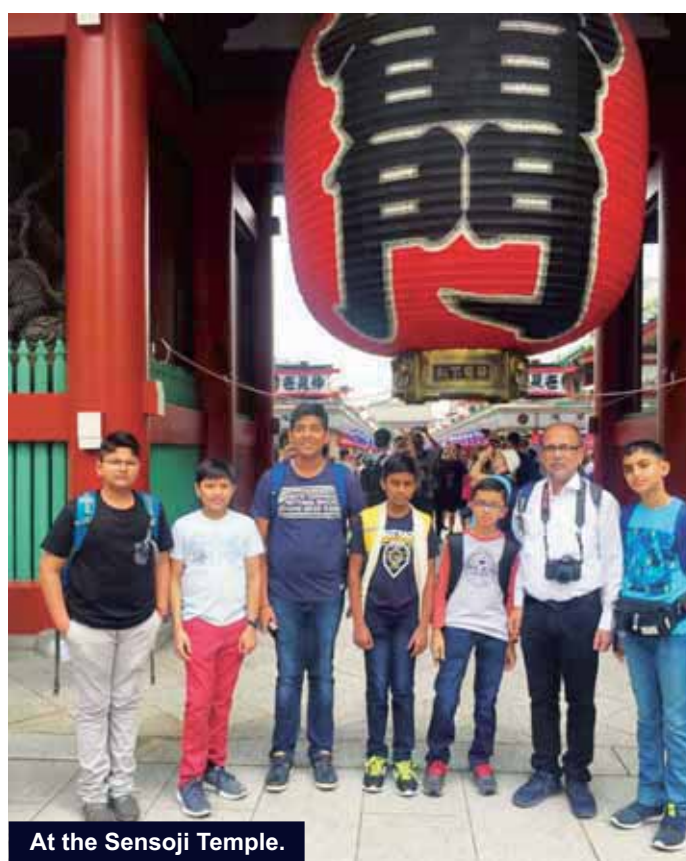
At the Sensoji Temple.

popular temples. The popular legend says that in the year 628, two brothers fished a statue of Kannon, the goddess of mercy, out of the Sumida River. Consequently, Sensoji was built nearby for the goddess of Kannon. The temple was completed in 645, making it Tokyo's oldest temple. In 7th century the samurai donated money to build the temple. Then we went to Meji Fingli Shrine in Mori forest which was built by a Professor of Tokyo University. We also saw the Panasonic Centre, where we had a lot of fun.