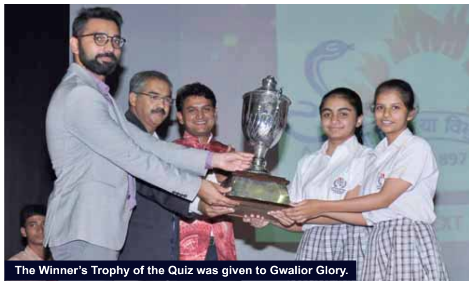
The Winner's Trophy of the Quiz was given to Gwalior Glory.

School. The preliminary round of the debate took place in two pools in the Music and the Art room on 1st September at 9 am. The topic of the debate was "In our stride towards freedom we are compromising with our ethical values". Three teams from each pool qualified for the Semi Final round of the Debate which was held in the Cambridge format. The three motions were- "This House believes that morality can exist without God and religion", " This House believes that privatization of education only deepens class disparity", and