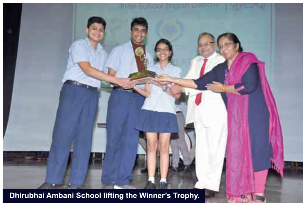
Dhirubhai Ambani School lifting the Winner's Trophy.

The 45th Platinum Jubilee Memorial Inter School English Debate was held in the School from 31st August to 2nd September 2018. Seven teams participated in the debate- Vasant Valley, New Delhi; Dhirubhai Ambani International School, Mumbai; Daly College, Indore; Mayo College Girls' School, Ajmer; All Saints College, Nainital; Welhams Girls' School, Dehradun; and The Scindia