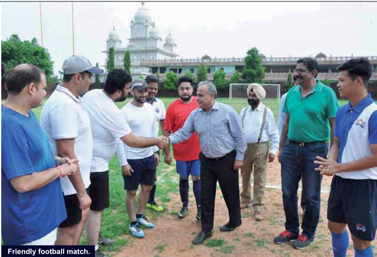
Friendly football match.