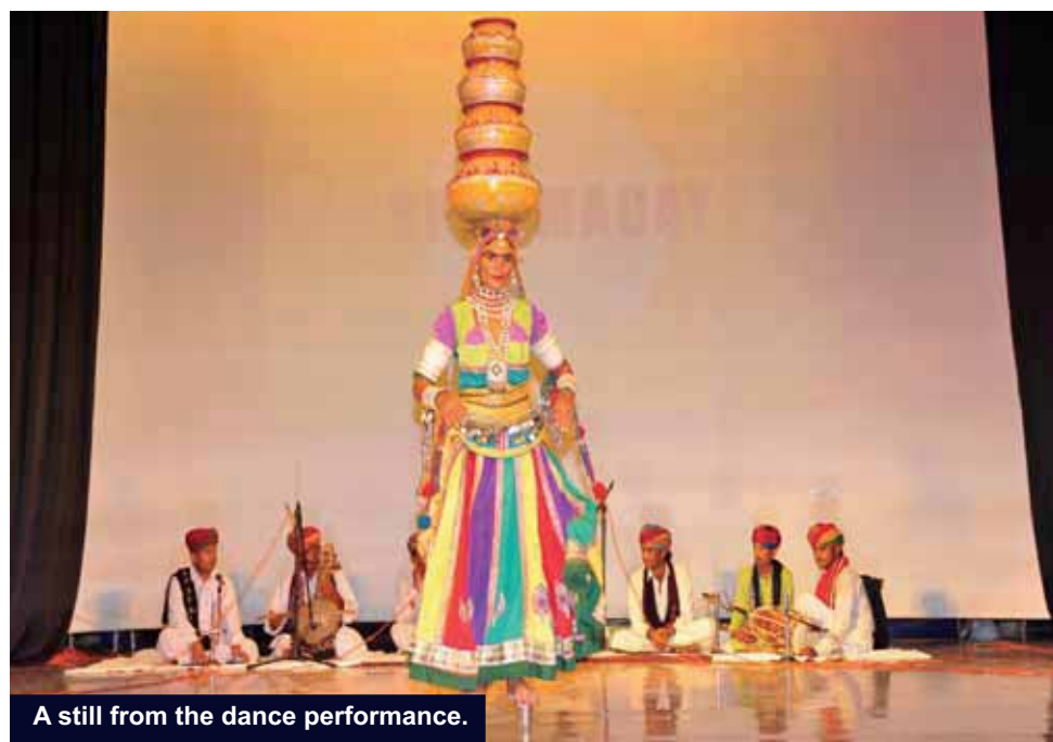
A still from the dance performance.