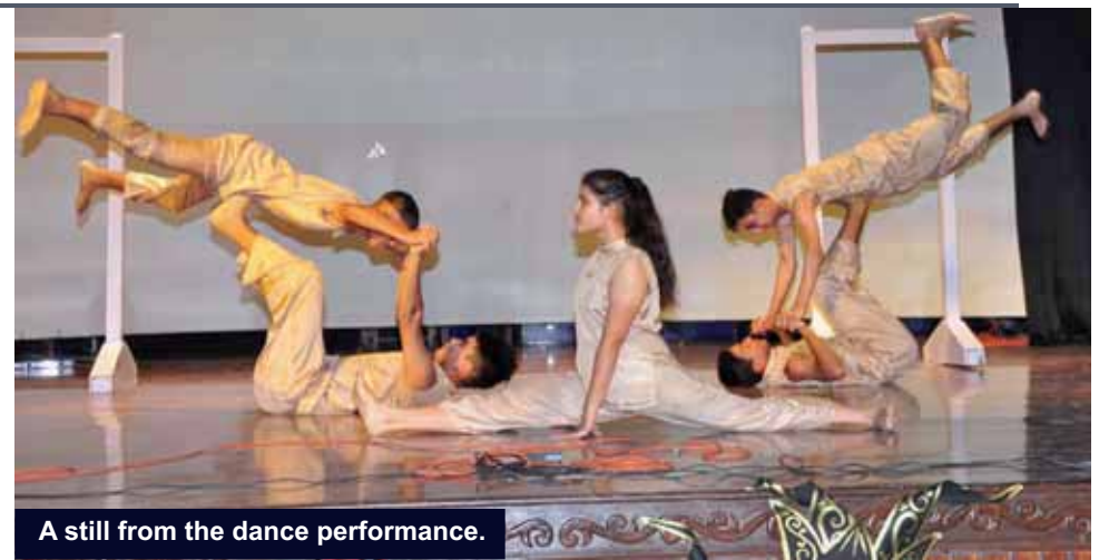
A still from the dance performance.

Ranoji and Jayaji Houses put up a spectacular House evening on the eve of the Independence Day. The event started with two wonderful musical