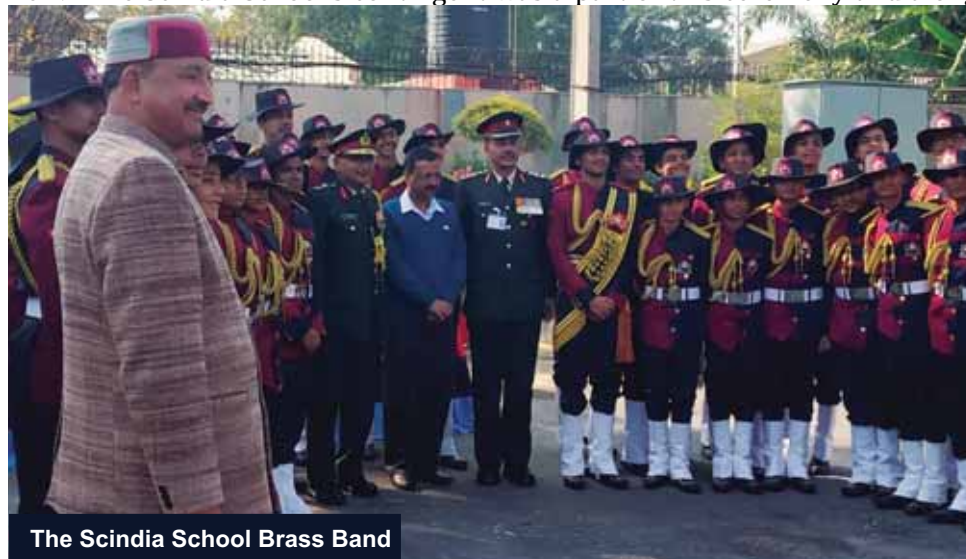
The Scindia School Brass Band

It was a moment of extreme pride as The Scindia School Brass Band gave the Guard of Honour to the Chief Minister of Delhi on the 9th January 2019; to Chief of Army Staff on 16th January 2019 and the Defence Minister on 22nd January 2019. The Scindia School's contingent was a part of this ceremony and along