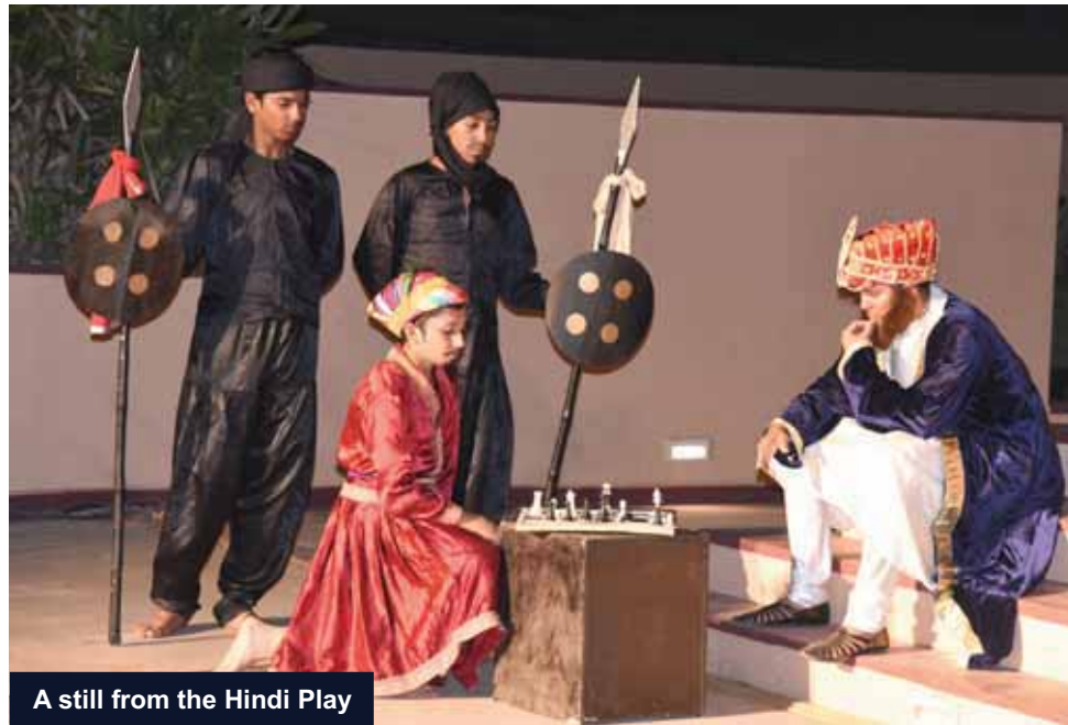
A still from the Hindi Play

Girish Karnad's classic master piece 'Tughlaq' was staged on 20th April 2019. The story of the play runs this way- a local court levies a penalty to Sultan Muhammad in lieu of harassment to a brahmin farmer. Later, he announces