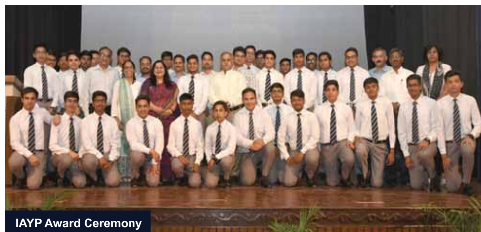
IAYP Award Ceremony

When one puts one's heart and soul into what one desires to achieve, it is not merely the end result that ought to be celebrated but the journey as a whole needs to be cherished. The IAYP Award Ceremony, which was held in the School on 19th April 2019 marks a moment of pride in each Scindian's journey of self-discovery. Events like these, acknowledge the efforts of teachers and achievements of students who collaborate for the development of young people. The participants gain the confidence to become committed young adults and they learn to channelize their aspirations to achieve something big and to bring about positive changes in their environment. The Award Ceremony is yet another milestone moment in Scindia School's stride that acknowledges the dreams of young people and their efforts to realize them. The International Award for Young People, popularly known as IAYP was founded by The Duke of Edinburgh, in conjunction with Kurt Hahn, the German educationist in 1956. Both were concerned that young people's development was lacking in certain key areas, and they resolved to create a programme that would be a 'do-it-yourself kit in the art of civilized living'. Although challenging, it lays emphasis on an individual's endurance to come out of his comfort zone and go the extra mile. Here, young people design their own Award Programme, set their own