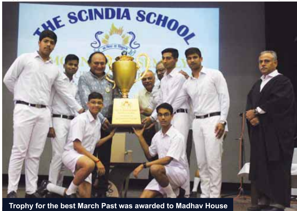
Trophy for the best March Past was awarded to Madhav House