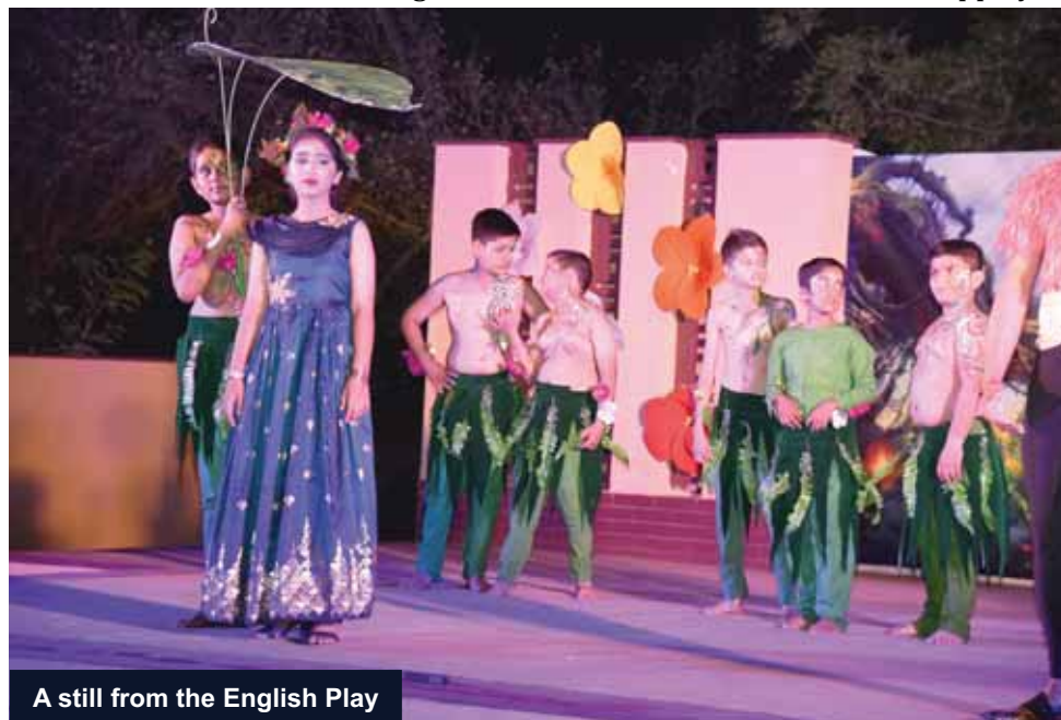
A still from the English Play

The English Play - A Midsummer Night's Dream was staged on 22nd April 2019. The play is a comedy written by William Shakespeare in 1595. It portrays the events around the marriage of Theseus, the Duke of Athens, to Hippolyta,