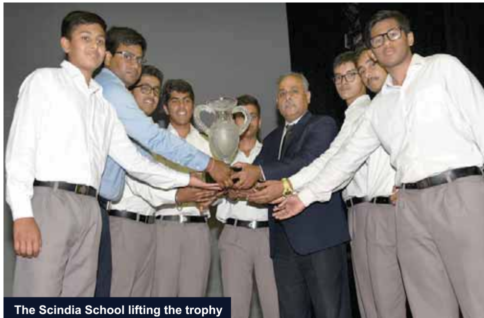
The Scindia School lifting the trophy