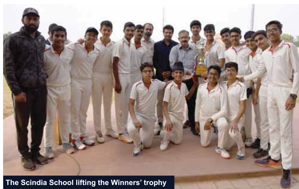
The Scindia School lifting the Winners' trophy