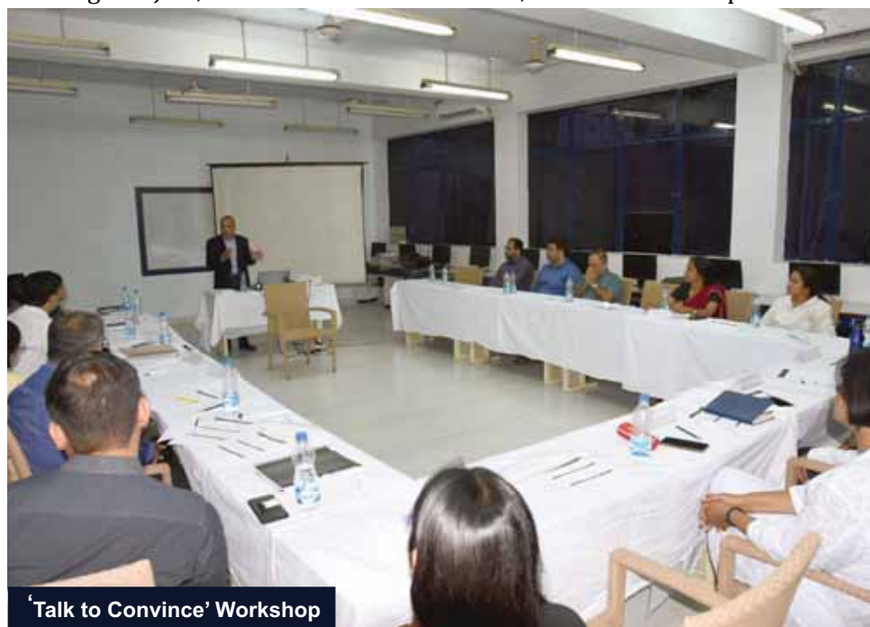
'Talk to Convince' Workshop