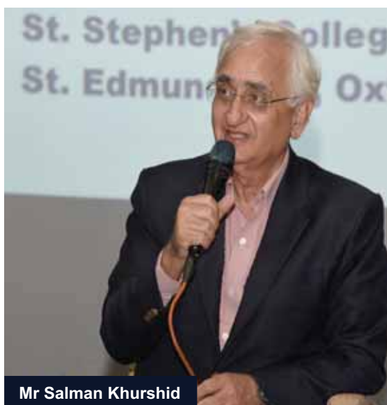
Mr Salman Khurshid

A session with Mr Salman Khurshid was held on 17th of November 2019, as the third session in the Assembly Hall on his book 'Visible Muslims, Invisible Citizens'. Mr Khurshid said that he has known many pass-outs from The Scindia School who are doing very well in all walks of life. He said that the youth of today must form an unbiased view of India which he likes to call as the 'idea of India'. He further said that the history of Gwalior is quite intertwined with the legacy that went on to form modern India.