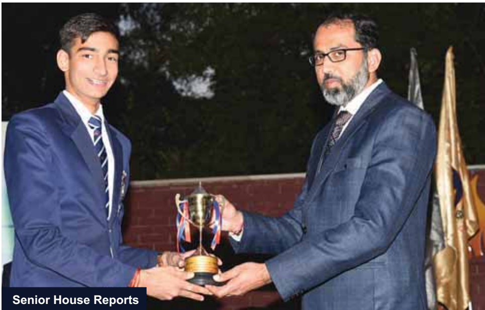
Senior House Reports