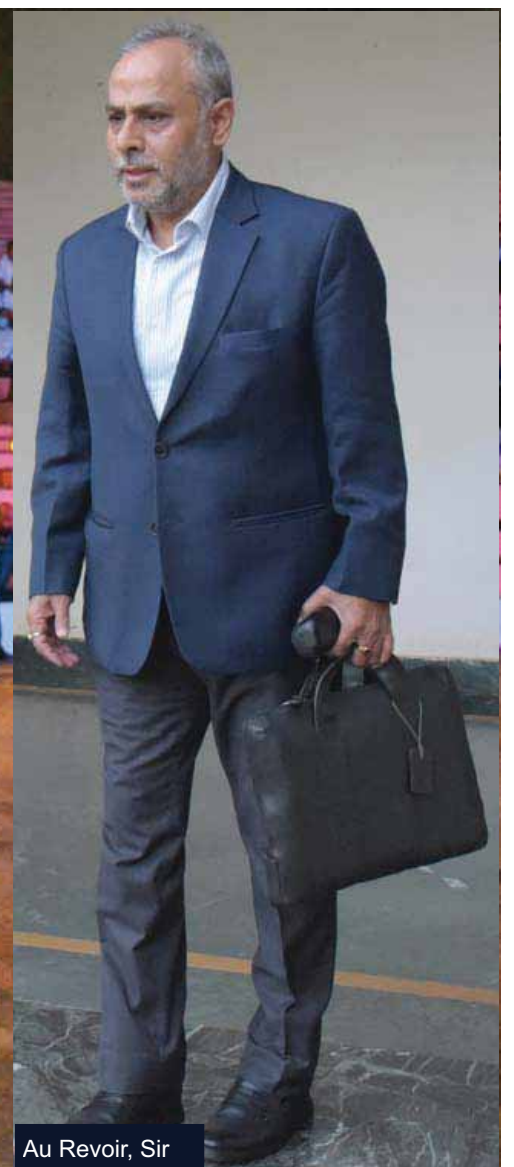
Au Revoir, Sir