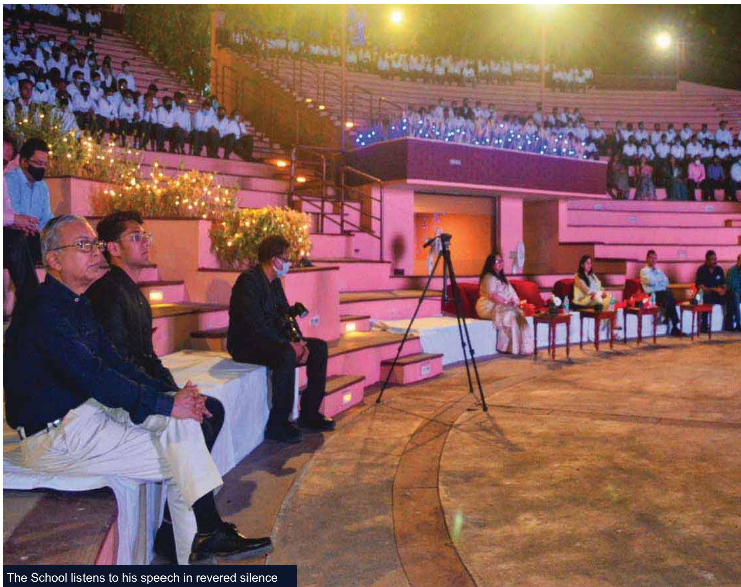
The School listens to his speech in reverend silence