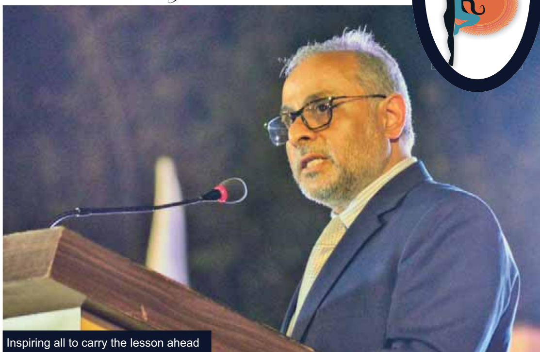
Inspiring all to carry the lesson ahead