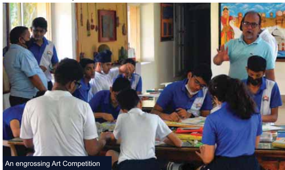
An engrossing Art Competition

The Manika Ghosh Memorial Art Inter-House Competition for Junior Group was held on the 20th of March 2022. Apart from Painting and Clay Modelling, Metal Work and Paper Mache were also included. The results are as follows: