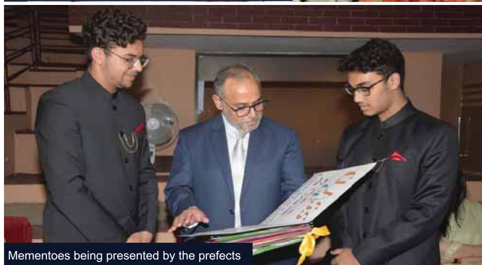
Mementoes being presented by the prefects