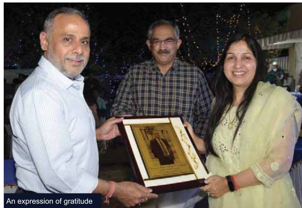
An expression of gratitude