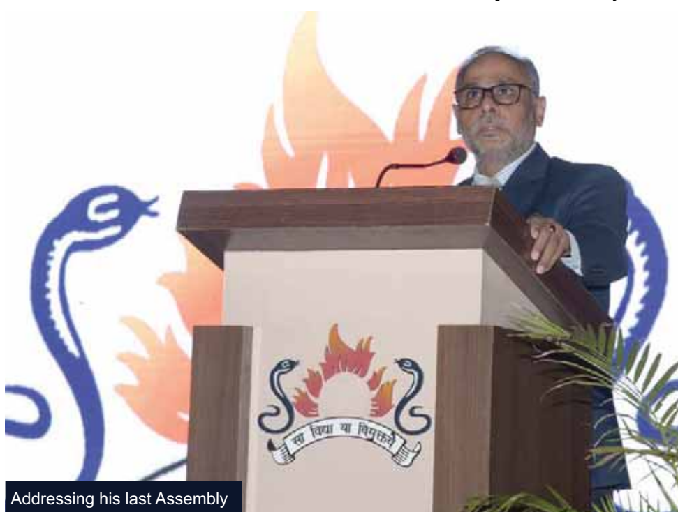
Addressing his last Assembly

Yes, as a community of teachers who understand the competition in the world, we have to take care of academic results. But at the same time, we have to strive for something greater- we have to be able to inspire our kids and ourselves as well – to be better humans. We have to inculcate a culture where health and stability of mind, body, emotions matter as much as marks (academic performance), if not more. We have to strengthen our core and understand the value of being a genuinely good person. We have to tell our kids the true narrative that after a point no one will remember how much you scored in Class 12th even though it means so much right now – after a point people will remember you by how you made them feel, how respectful you are, how caring you are, how patient, honest, kind, helpful you are. Truth be told- that is the only way I decide who will be my company. We have to learn ourselves and