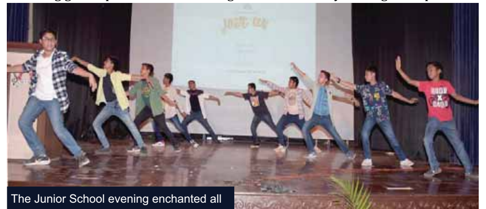
The Junior School evening enchanted all