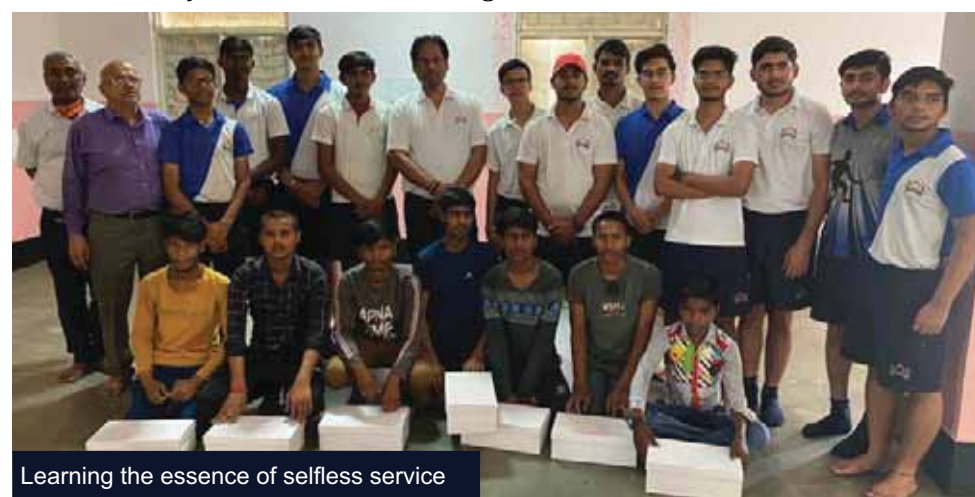
Learning the essence of selfless service

The Scindia School looks forward to extending such support and help towards the community and to continue setting benchmarks in social service.