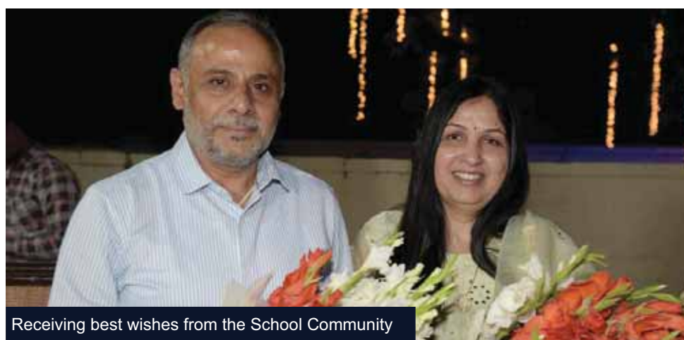
Receiving best wishes from the School Community