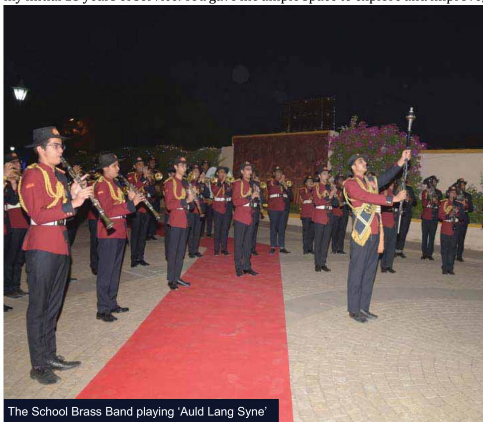
The School Brass Band playing 'Auld Lang Syne'