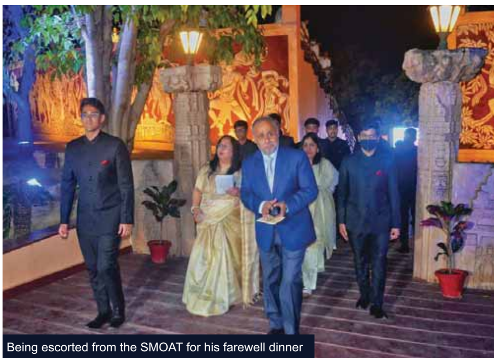
Being escorted from the SMOAT for his farewell dinner

Good evening, everyone, respected principals, deans, teachers, and my fellow Scindians, we are gathered here today to bid farewell to a highly valuable