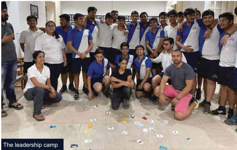
The leadership camp

were given an opportunity to introspect and reflect about their weaknesses and strengths. In a fun-filled manner, they also learnt the skills of handling difficult conversations, adjusting with others and working with new teams. They emerged better prepared to be motivators and leaders of their school and the society at large.