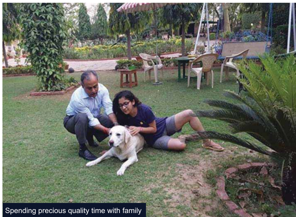
Spending precious quality time with family