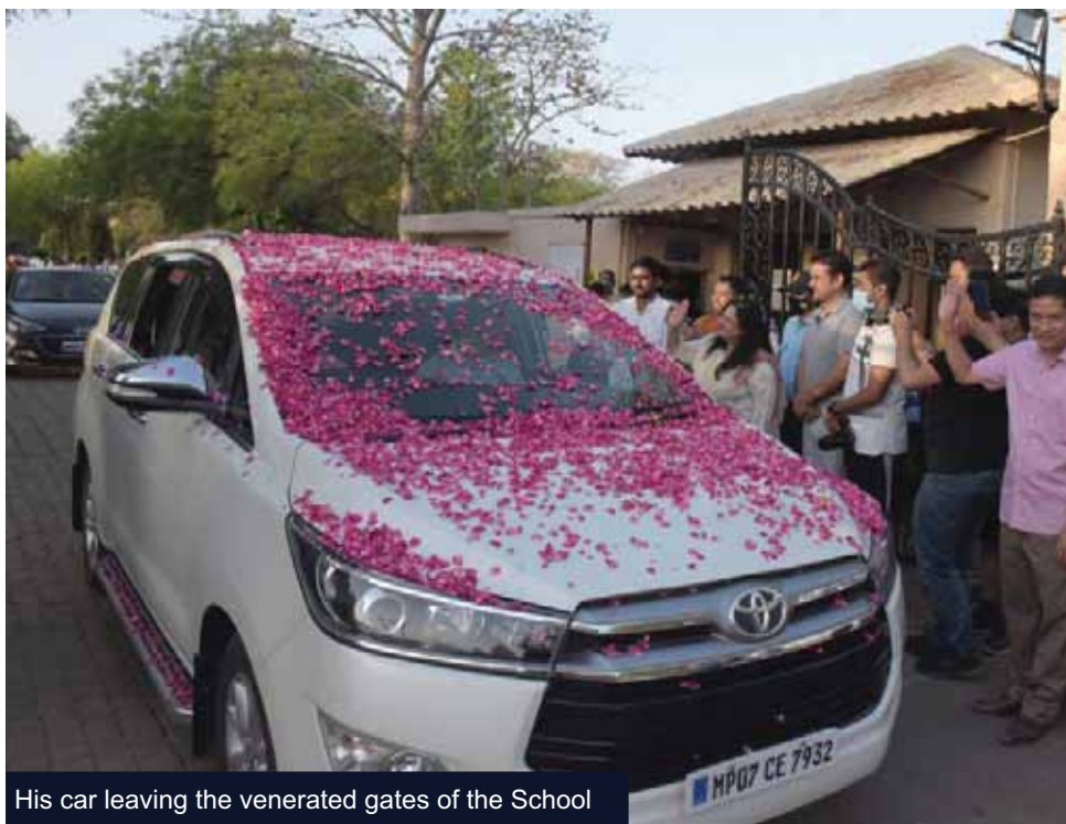
His car leaving the venerated gates of the School

The early morning of the 31st of March saw the students lined up starting from the Principal's residence to the main gate of the school along with housemasters and faculties, with rose petals in their hands to shower upon the Principal's car. This was a very sentimental moment, notable for the fact that