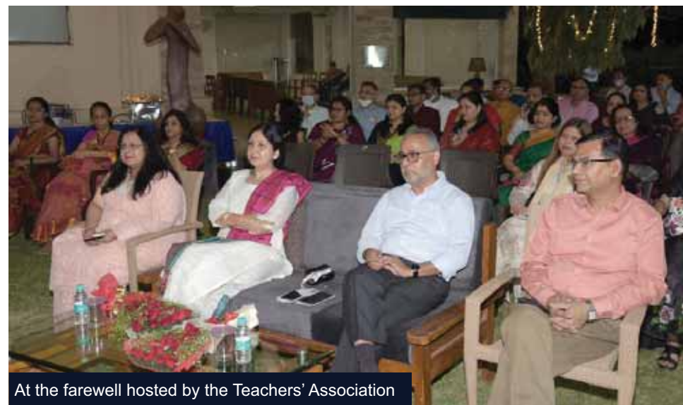
At the farewell hosted by the Teachers' Association