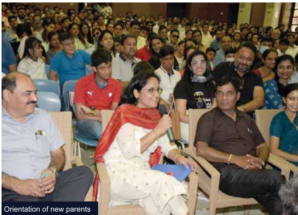
Orientation of new parents

With open hearts and beaming smiles, we welcomed our new students to the campus. The Orientation Programme for new students of the school was conducted on 11 July 2022 in the Assembly Hall. The Principal, Deans and a