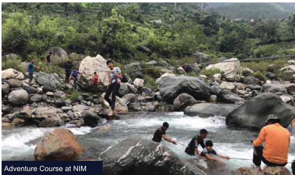
Adventure Course at NIM

8 high-spirited students of class X participated in the 14 days' Adventure Course from 10 June 2022 to 25 June 2022 at the prestigious Nehru Institute of Mountaineering, Uttarkashi. During the course they were exposed to various outward-bound activities like Trekking, Rock Climbing, Bush Craft,