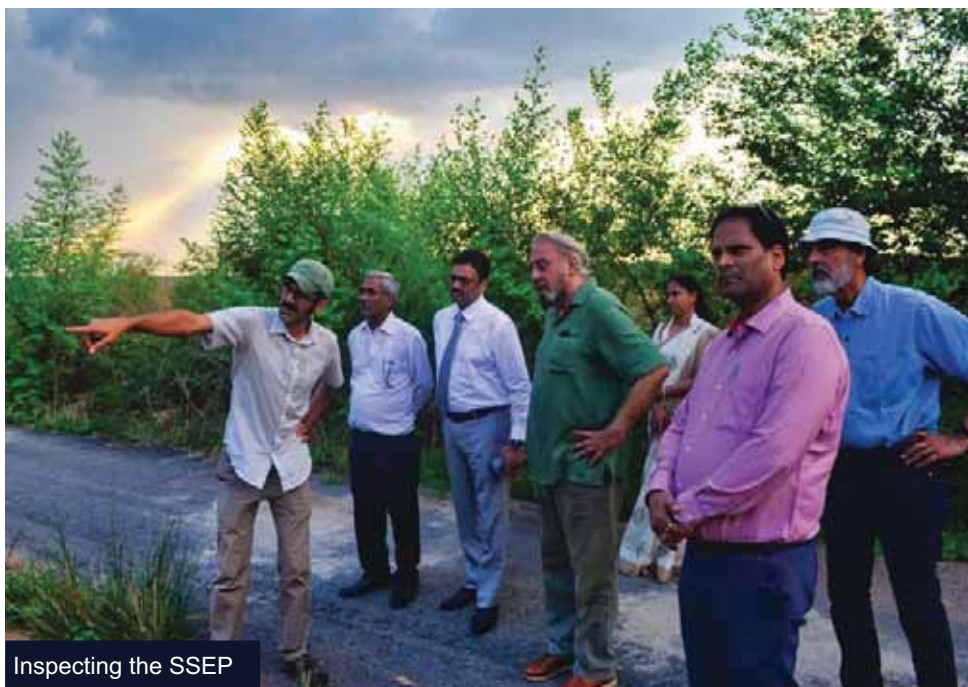
Inspecting the SSEP