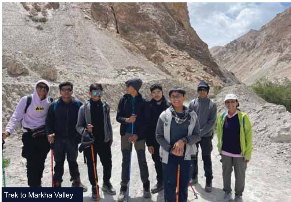
Trek to Markha Valley