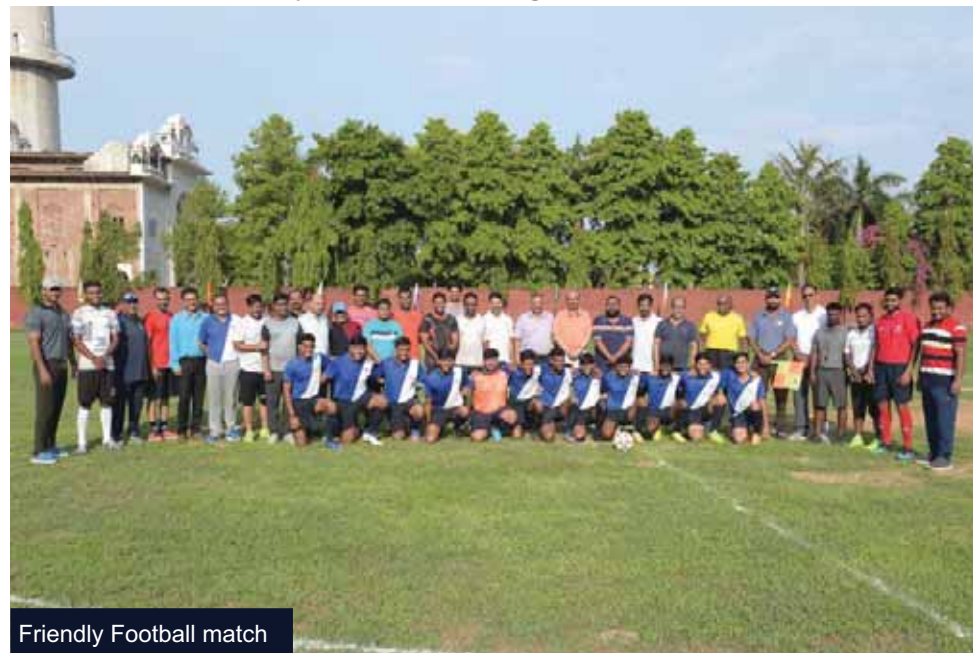
Friendly Football match

The Football Season on the campus started with a friendly match between staff and students on 16 July 2022. It was a sight to see as the students and their