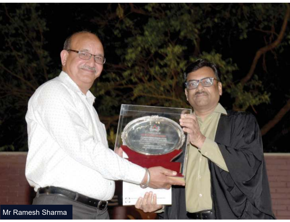
successfully organized the IPSC band Competition.

in Music for many students. Her renowned students have publicly expressed their gratitude on many occasions. Under her guidance Junior students enjoyed daily assembly, Krishna Janmashtami, Ganpati Celebrations, Freshers Play, Junior House Evenings and many more celebrations. She directed plays, skits, and prepared students for elocutions with equal ease. She remained with Junior school for 15 years as a Hindi and Music teacher. She was the first House master of the then newly created House- Nimaji. As a Housemaster she was a strict disciplinarian with a lot of warmth. In 2000, she moved to the Senior School. She is best remembered for her contribution to Founder's Day and Annual plays with her team. She rose to become the Dean of Activities after her term as a Housemaster was over. She had also organized interaction with the differently abled school students, also enthusiastically participated in community service programs. The school witnessed Musical Ballet and Musical drama during her tenure. A relentless perfectionist, learner, graceful, sincere, and persuasive leader with infectious laughter, that is how school will