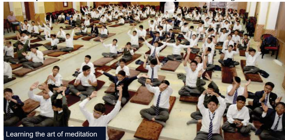
Learning the art of meditation

From 22nd to 24th February 2024, a delegation from The Art of Living took workshops for classes VI to VIII in the assembly hall. They taught the student