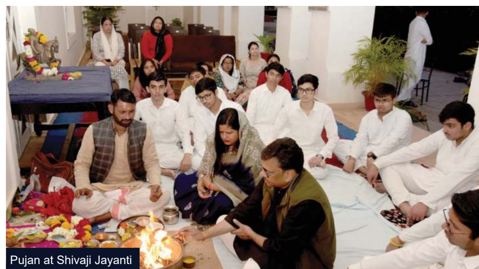
Pujan at Shivaji Jayanti

On the evening of 19th February 2024, The students of Shivaji House celebrated Shivaji Jayanti. A puja was organised on this day for the students who are