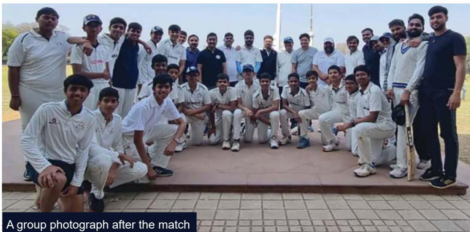
A group photograph after the match

On 18th February 2024, an exciting cricket match took place at Madhav Field, pitting the staff against the students in a friendly competition. The match was