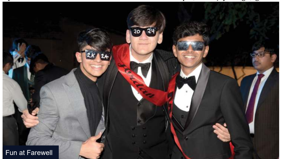
Fun at Farewell