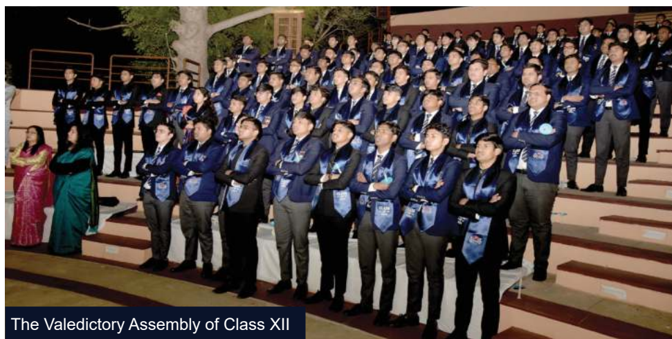
The Valedictory Assembly of Class XII

The Valedictory Assembly was conducted on 14th February 2024. The custom of burning candles represented the students' dedication to disseminating