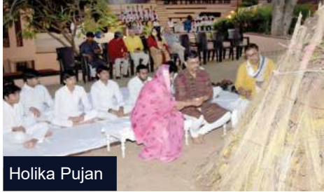
played with eco-friendly colors, then enjoyed sweet 'Pedas' and refreshing 'Thandai'. A celebration of spring, joy and tradition!

On 24th March 2024, the school celebrated 'Holika Dahan' with great enthusiasm. As per the rituals a puja was conducted. Every student participated in the 'Holika Pujan' followed by a Holi song, humorous poetry recitations, and lively dance performances. On the following day, the school was coloured with vibrant colours of Holi! Students