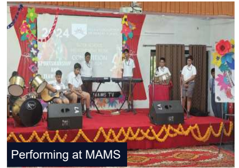
Performing at MAMS

Anandmayee Memorial School (MAMS), Haridwar organised on