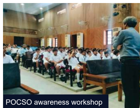
POCSO awareness workshop

A POCSO awareness workshop for students from classes VI to XII was organised on 10th and 11th August 2024.