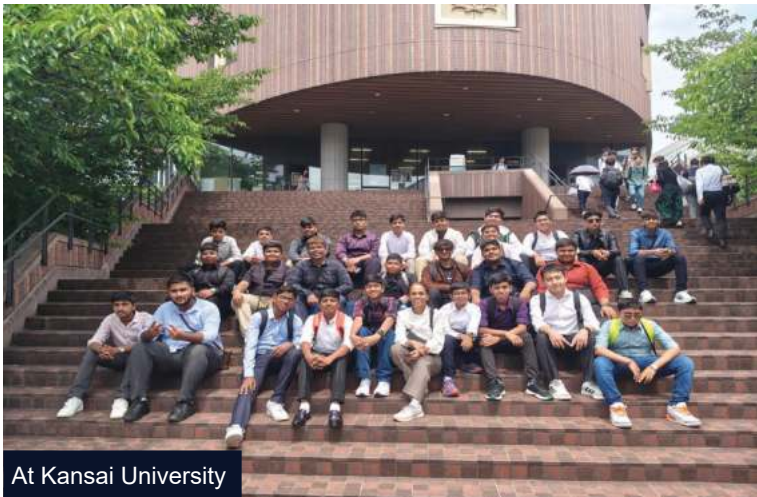
At Kansai University

Kyoto presented a very different ambiance — serene, historic, and with lots of cultural charm. We toured the old Japanese shrines and marveled at the architecture, even partaking in a little traditional ritual. The serenity of the setting, the bell-like sound, and the fragrance of incense made Kyoto an existing time capsule. The next day we found us on another Shinkansen to Osaka, a vibrant city with its markets, street eats, and welcoming locals. Venturing out to the local markets was a culinary enthusiast paradise — Takoyaki, sushi, mochi, matcha everything we indulged in it all. But things really got very interesting when the whole crew somehow ended up split up into four different groups while venturing out. With no agreed-upon meeting spot, it took dozens of calls, some walking in circles, and some collaboration to reunite everyone. It was crazy but funny — something we'll be joking about for years. To add to the adventure, one student was left behind at a BIC shop while the rest of us had already proceeded to the metro station. Fortunately, thanks to our guide and some speedy calls, they caught up with the group — something that we all recall with a touch of panic and laughter. Osaka also instilled patience