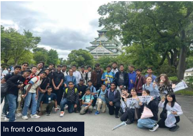
In front of Osaka Castle

and late-night collaboration in us in ways we never could have expected. Let's just say that advanced lock mechanisms can be tricky to comprehend when nobody around seems to know the password, and that standing outside in the stars together in silence with 12 other individuals can be an extremely bonding experience. The group also visited the famous amusement park, Universal Studios, Osaka, where we spent the entire day snacking and getting on scary rides, one of the Jurassic Park rides got us completely wet and yet we marched on, determined to make the most of the day as we explored the huge park. Even the laziest of us had at least twenty thousand steps by the time we reached back to our hotel. While Universal studios was a fun experience, a more breath-taking one was the Osaka EXPO 2025, where all the countries had gathered to share their exhibitions and cultures with others. There were exhibitions everywhere and awe-inspiring displays of how each culture interpreted life in different ways.