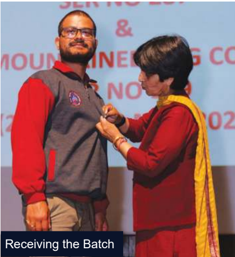
Receiving the Batch

Being born in Uttarakhand, also known as Devbhoomi (The Land of the Gods), I have always shared a natural bond with the mountains. Growing up amidst the Himalayan ranges, I developed a deep fascination for their beauty, strength, and spiritual presence. I’ve always been adventurous at heart, and one of my long-standing dreams was to pursue professional mountaineering training from one of India’s best institutes — the Nehru Institute of Mountaineering (NIM), Uttarkashi. I feel fortunate that The Scindia School gave me the opportunity to turn this dream into reality by sponsoring my participation in the Basic Mountaineering Course (BMC). This course not only sharpened my technical skills but also tested and strengthened my physical endurance, mental resilience, and emotional discipline.