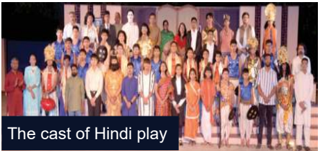
The cast of Hindi play

अतीत और वर्तमान के दृश्यों के बीच संक्रमण अत्यंत सहज था। साथ ही, प्रॉप्स, वेशभूषा और पृष्ठभूमि संगीत के प्रभावी उपयोग ने कहानी को और अधिक प्रभावशाली और भावनात्मक बना दिया।