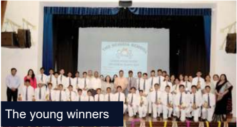
The young winners

Junior House Reports The students of junior school were honored followed by their house reports on 23rd April 2025, The following received recognition for the same-