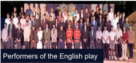
Performers of the English play

The English Annual Play, staged on 26th April at the Shukla Memorial Open-Air Theatre, brought alive the timeless tale of ‘The Strange Case of Dr Jekyll and Mr Hyde.’ The gripping adaptation presented by the English Department explored deep themes of duality and inner conflict, leaving the audience spellbound and emotionally stirred. Through seamless transitions between the two characters, evocative