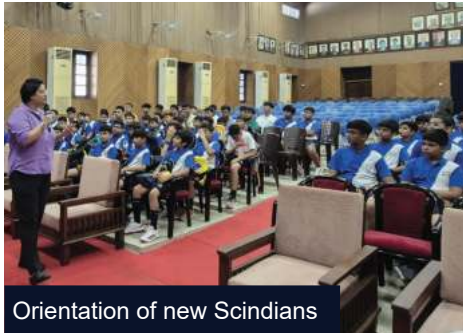
Orientation of new Scindians

On 5th July, students from classes VI to XI attended a workshop titled “Understanding Friendship, Conflict Resolution and Gender Sensitization.” The session included role-plays and discussions that encouraged students to reflect on friendship, behaviour in