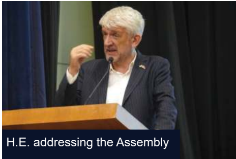
H.E. addressing the Assembly

In his address to the students, the Ambassador expressed that this visit would remain one of his most cherished memories. He delivered an inspiring speech, emphasising the value of resilience, ambition and the importance of treasuring one's school experiences. The core of his message was a powerful reminder: while life may bring many challenges, it is one’s