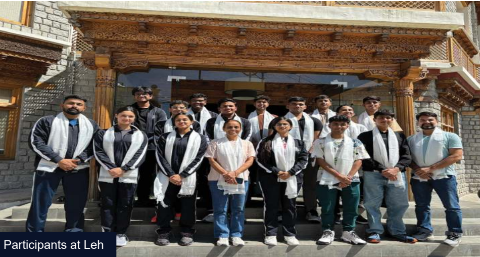
Participants at Leh