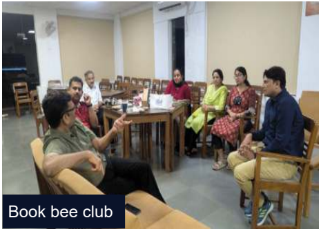
Book bee club

Book Bee Session The first meeting of the Book Bee Club was held on 19th July 2025 in the FRC Lounge with nine faculty members. The session focused on To Sir, With Love , beginning with selected video clips, the film’s trailer, and a review from The New York Times . The story follows Rick, a former Royal Air Force officer and Cambridge graduate, who takes up a teaching position at a school in East End London after facing racial discrimination in the job market.