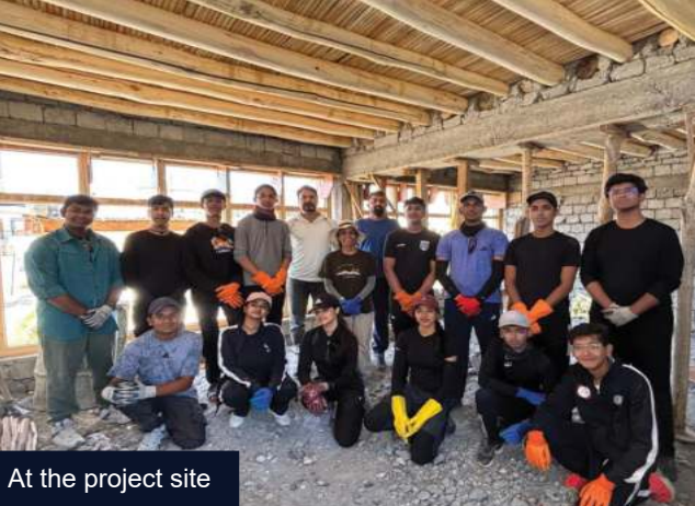
At the project site