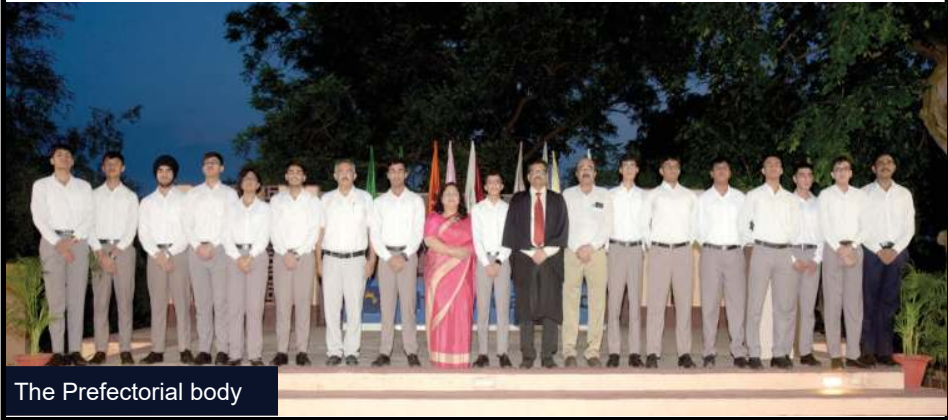
The Prefectorial body

The Games Captains for the year 2025-26 were announced on 15th July 2025. The names are as follows: