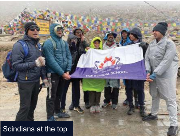
Scindians at the top