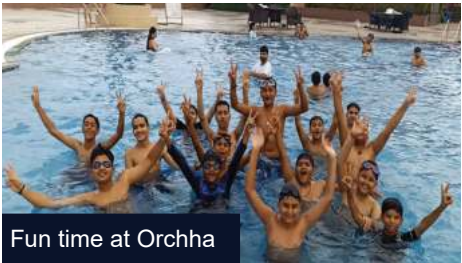
Fun time at Orchha

As we entered Orchha, we were thrilled to see the welcome sign. Upon reaching the hotel, we checked into our rooms and were soon led to a beautifully decorated party hall. Balloons, music, and cheerful vibes greeted us. We participated in various engaging sessions—one on communication skills, another on the inspiring success stories of Scindians, and exciting bonding games with our housemates. These moments helped us connect deeply with each other and our teachers. In the evening, a DJ night lifted our spirits, and we danced and feasted together. The next day, we explored the majestic Orchha Palace, learning about its rich 16th-century history. Later, a refreshing pool party brought more fun and laughter. What made this trip truly special was the warmth, the learning, and the lifelong bond we began building with our mentors and peers.