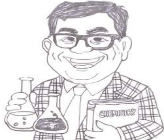
KARL MAX II