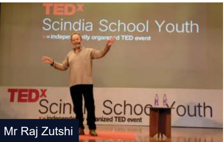
Mr Raj Zutshi

Mr Raj Zutshi (Ex-Vivekanand, 1977) – An Actor, Mr Raj Zutshi shared his journey from school to college and