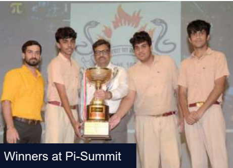
Winners at Pi-Summit