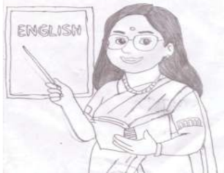
NO LAB DURING THE NIHARI

DO YOU KNOW HOW MANY BATCHES I HAVE TAUGHT ?