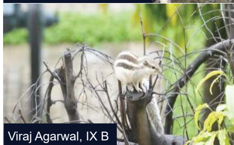
Viraj Agarwal, IX B