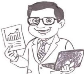
TA DHIN DHIN TA