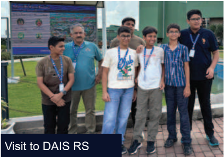
Visit to DAIS RS