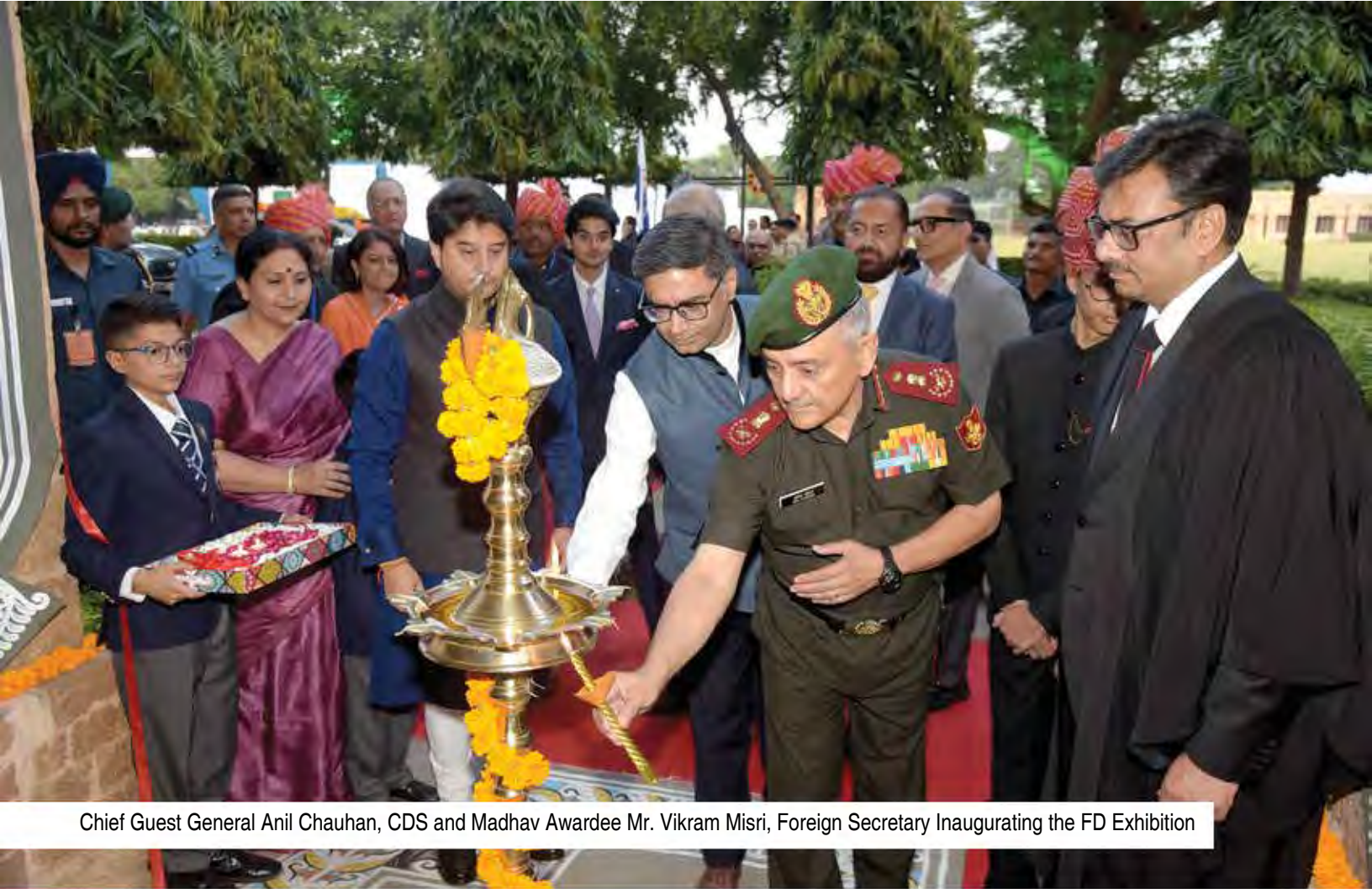
Chief Guest General Anil Chauhan, CDS and Madhav Awardee Mr. Vikram Misri, Foreign Secretary Inaugurating the FD Exhibition