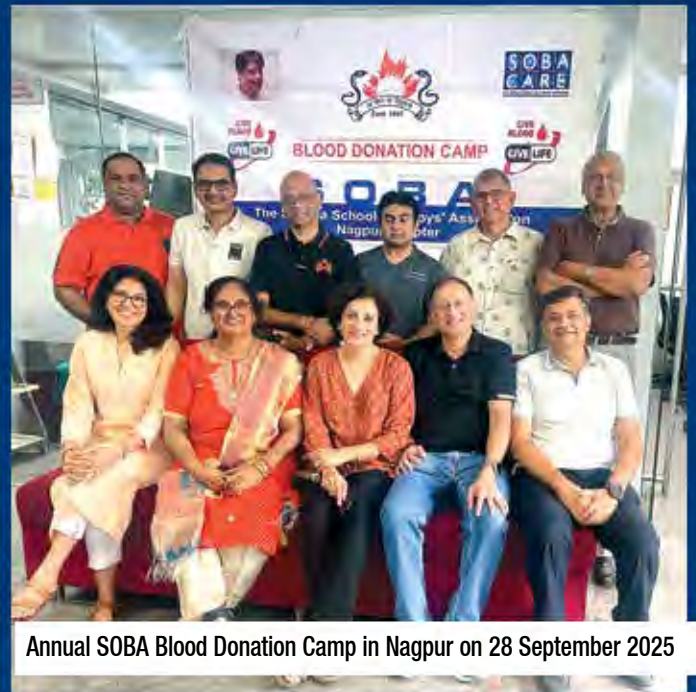
Annual SOBA Blood Donation Camp in Nagpur on 28 September 2025