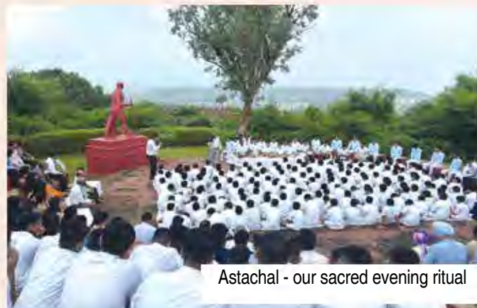
Astachal - our sacred evening ritual