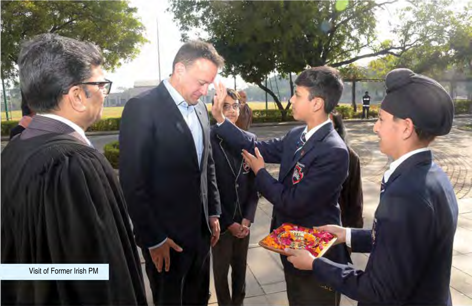
Visit of Former Irish PM