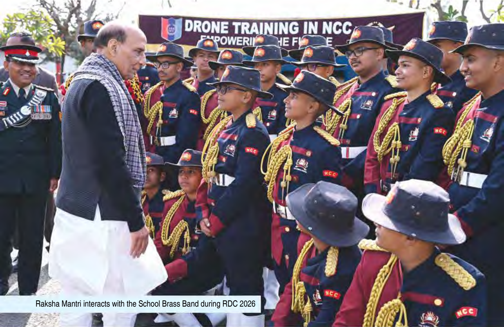
Raksha Mantri interacts with the School Brass Band during RDC 2026