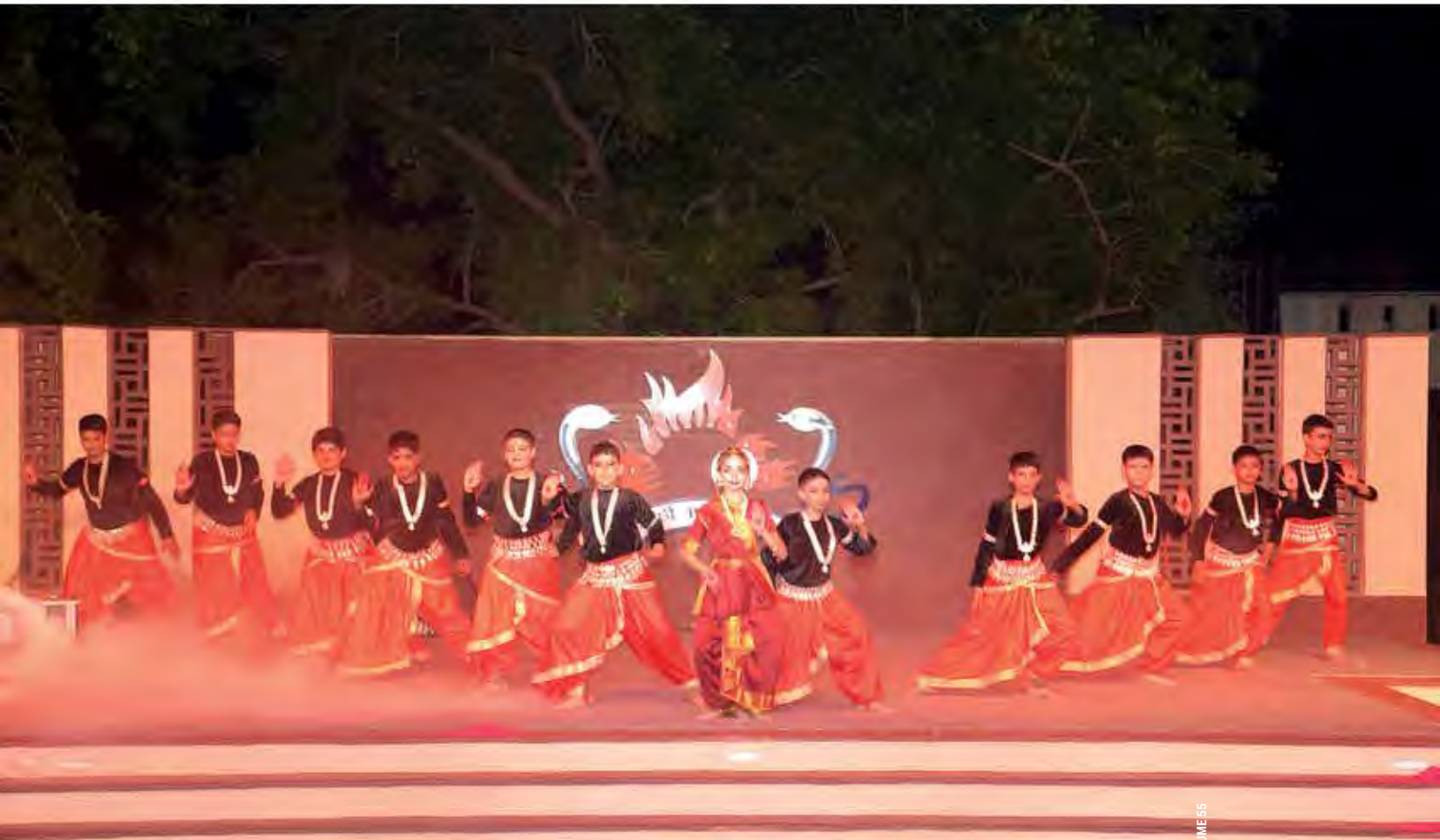
Founder's Day Choreography